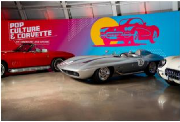
American Love Affair: Pop Culture & Corvette

From the silver screen to country music stars, Corvette has been front and center in America's love affair with speed and style and pop culture. The rotating collection currently features GM's Corvette Stingray Concept, better known as Sideswipe from Transformers: Revenge of the Fallen , and Brad Paisley's 1962 Corvette. Don't miss the immersive Skydome experience that puts you right in the scene with these legendary cars.