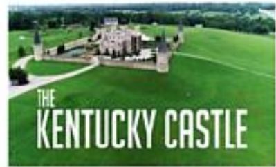
The Kentucky Castle

Enjoy comfortable hotels and delicious meals at restaurants for GCCC members.