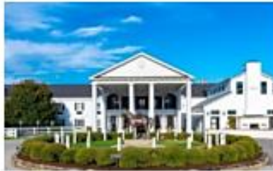
The Campbell House