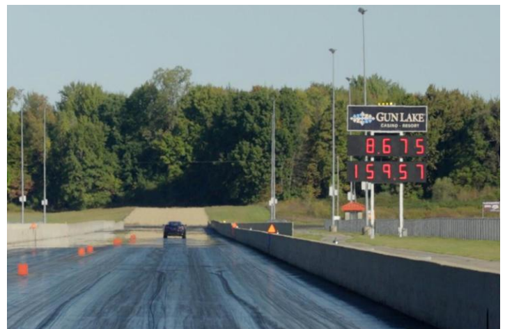
Corvette ZR1X completes the quarter mile in 8.675s at 159.57