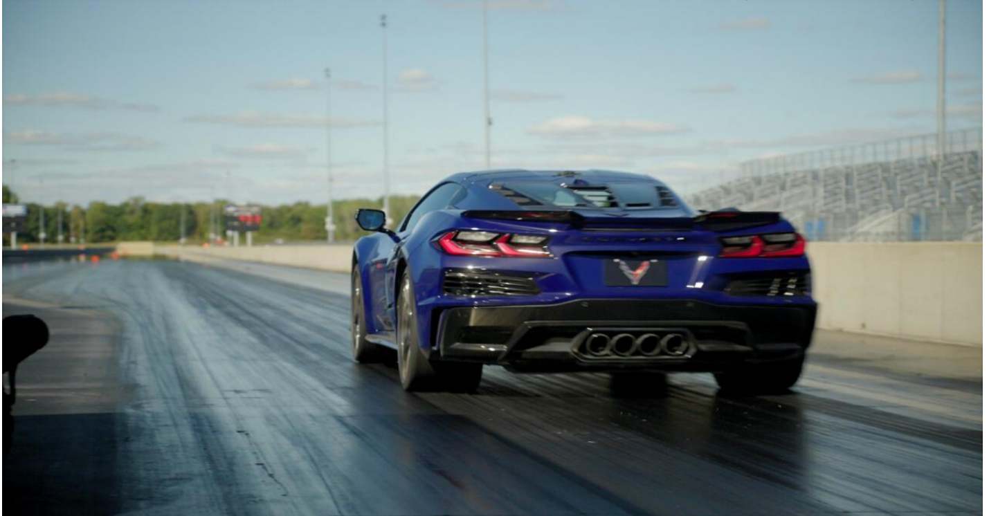
Rear view of preproduction Corvette ZR1X on the drag strip

The Chevrolet Corvette ZR1X, the most advanced Corvette ever, is the quickest American production car available – and the fastest way to get down a quarter-mile drag strip for under a million dollars.