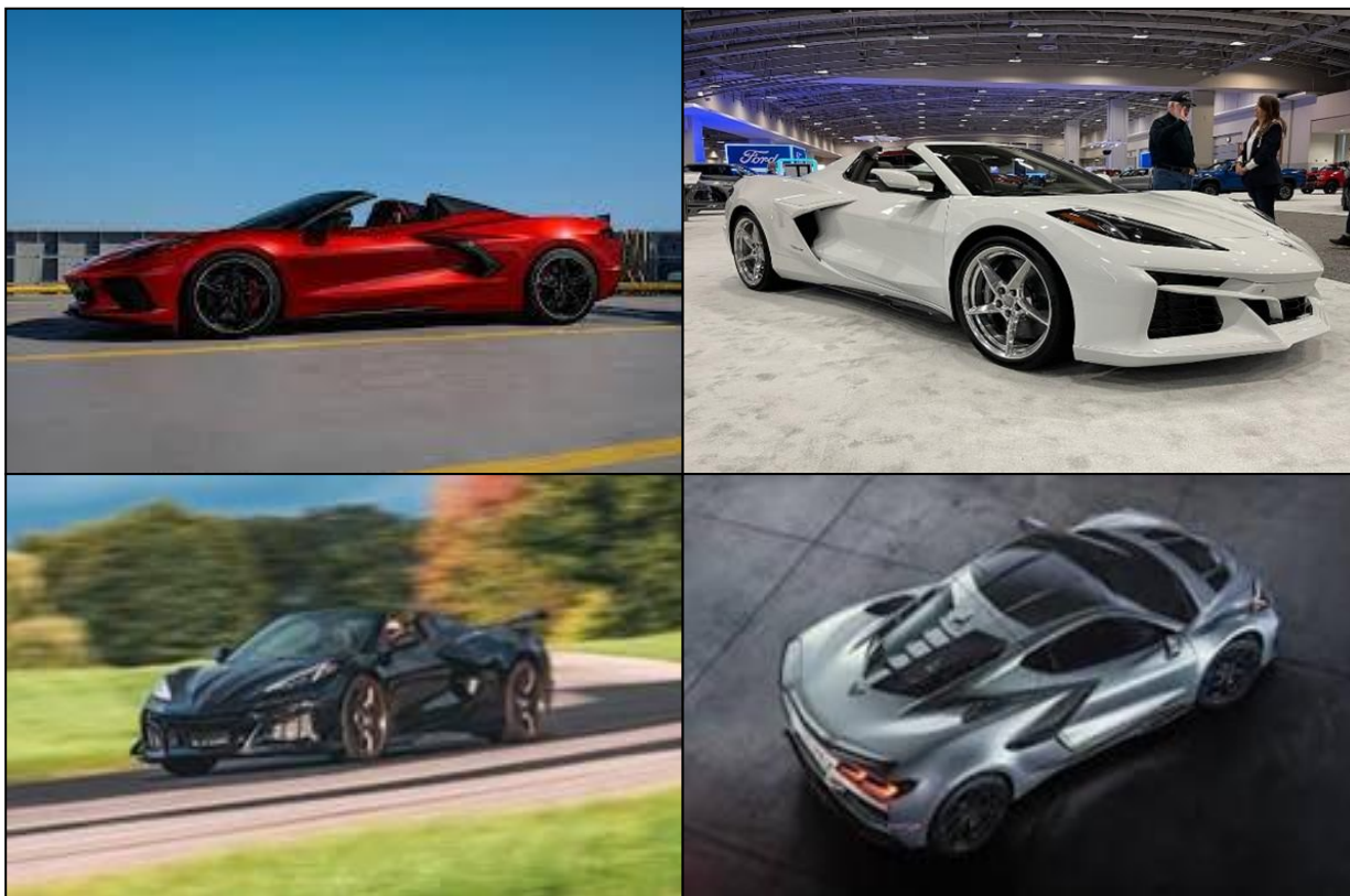
Top left, Corvette Stingray, top Right Corvette E-Ray, bottom left Corvette Z06, bottom right Corvette ZR1X

Thinking about a new 2026 Stingray? The 2026 models of the Stingray, E-Ray and Z06's are in stock and often discounted as much as 10-15%. What can you expect from the 2026 line-up?