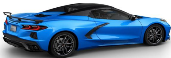
2026 Riptide Blue Convertible Price: $200.00 Tickets: 1500 Drawing: October 23, 2025

NCM Raffle Purchase online or print order form and mail in. Current Corvettes being raffled: