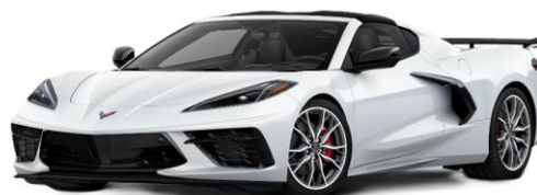
2026 Arctic White Coupe Price: $150 Tickets: 1500 Drawing: November 20, 2025