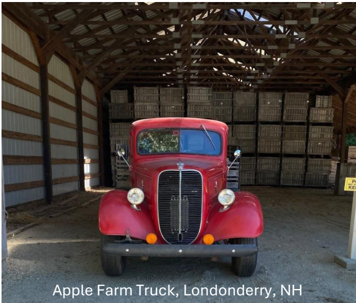
Apple Farm Truck, Londonderry, NH