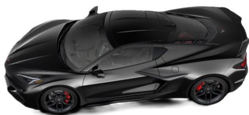
2026 Black Z06 Coupe Price: $300.00 Tickets: 1500 Drawing: December 18, 2025