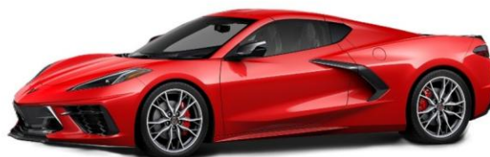
2026 Torch Red Coupe Price: $20.00 Tickets: Unlimited Drawing: April 25, 2026

To learn more visit: https://raffle.corvettemuseum.org/index.cfm