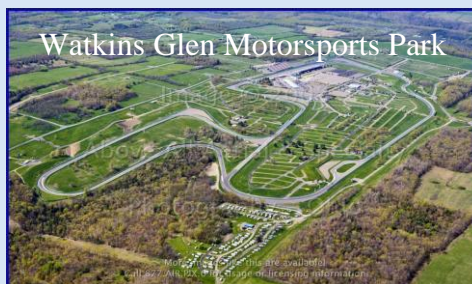
Watkins Glen Motorsports Park