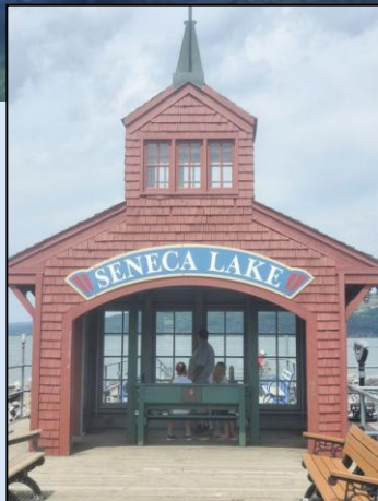
Seneca Harbor Restaurant Tuesday Evening Dinner