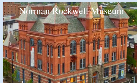
Norman Rockwell Museum