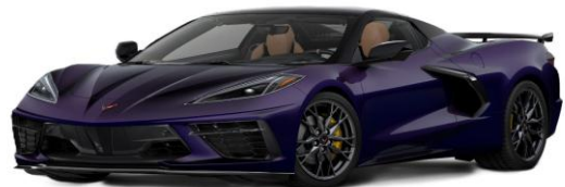
2025 Build Your Own Corvette Price: $250.00 Tickets: 1500 Drawing: June 19, 2025 2:00 PM

To learn more visit: https://raffle.corvettemuseum.org/index.cfm