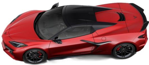
2025 Red Mist Z06 Convertible Price: $300 Tickets: 1500 Drawing: April 25, 2025

NCM Raffle Purchase online or print order form and mail in. Current Corvettes being raffled: