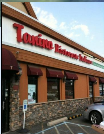
Tanino's Restaurant Monday Evening Dinner