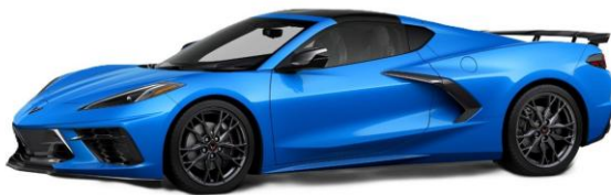
2025 Riptide Blue Coupe Price: $150 Tickets 1500 Drawing: May 22, 2025