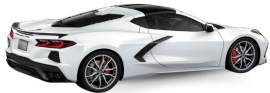
2025 Arctic White Coupe Price: $20 Tickets: Unlimited Drawing: April 26, 2025