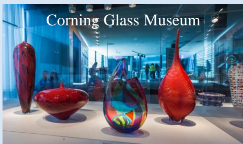
Corning Glass Museum