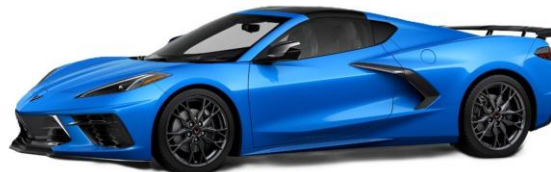
2025 Riptide Blue Coupe Price: $150 Tickets 1500 Drawing: May 22, 2025

To learn more visit: https://raffle.corvettemuseum.org/index.cfm