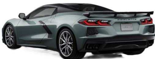
2025 Sea Wolf Gray Convertible Price: $200.00 Tickets: 1500 Drawing: April 17, 2025 2:00 PM

NCM Raffle Purchase online or print order form and mail in. Current Corvettes being raffled: