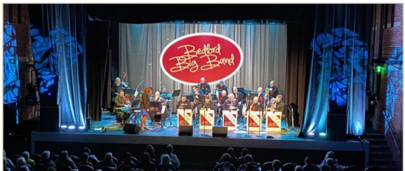
Bedford Big Band at the Rex Theater

The purpose of Gate City Corvette Club is to make being a Corvette owner more fun. Our club meets the second Friday of the month at Murphy's Taproom & Carriage House, 393 State Rte. 101, Bedford, New Hampshire. Looking forward to seeing you there!