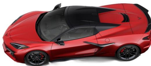
2025 Red Mist Z06 Convertible Price: $300 Tickets: 1500 Drawing: April 25, 2025