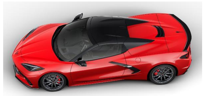
2023 Torch Red Convertible Unlimited Raffle Price $20.00 Drawing 04/29/2023

To learn more visit: https://raffle.corvettemuseum.org/index.cfm