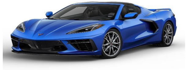
2023 Elkhart Lake Blue Coupe (Tickets 1500) $150.00 Drawing 12/01/2022