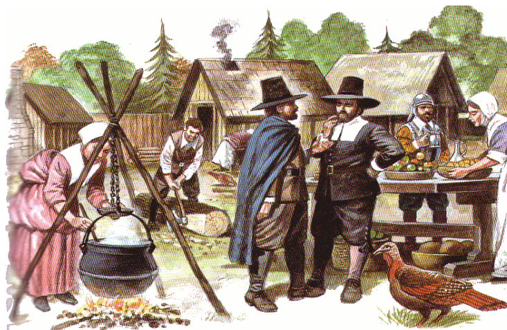
The First Gate City Corvette Club Picnic