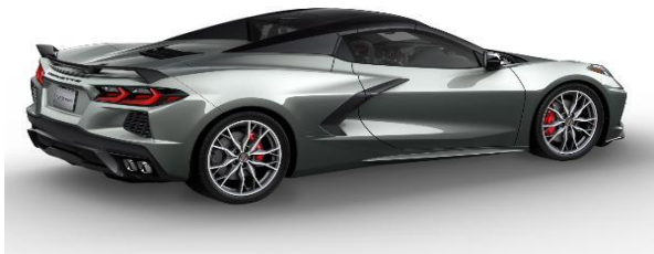
2023 Hypersonic Gray Convertible (Tickets 2000) Price $200 Drawing 11/10/2022