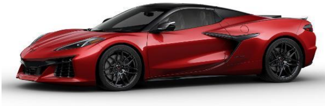
2023 Red Mist Z06 Convertible (Tickets 2500) Price $350 Drawing 12/15/2022