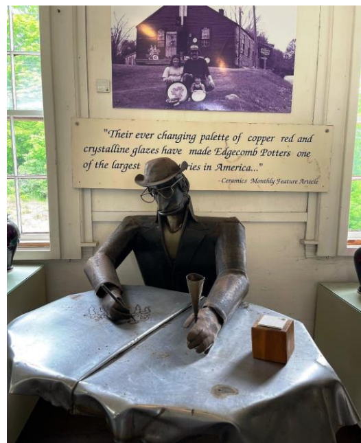
Edgecomb Pottery Made in Maine