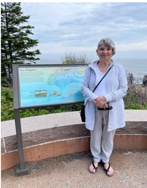
Sightseeing in Bar Harbor