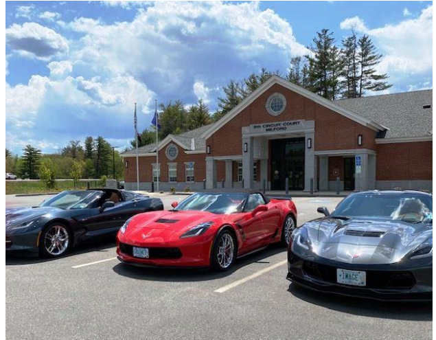
Gathering in Milford to go to Kimball Farm in Jaffrey