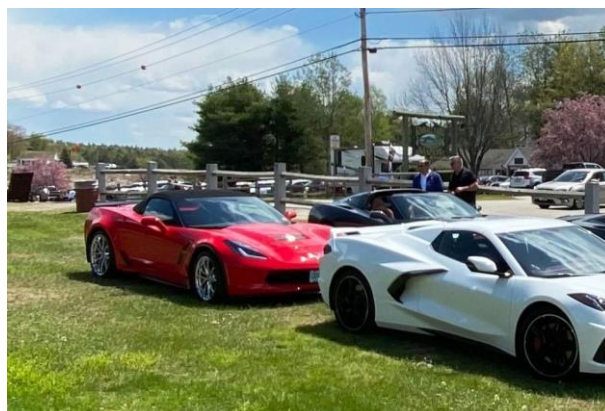
Kimball Farm in Jaffrey, NH