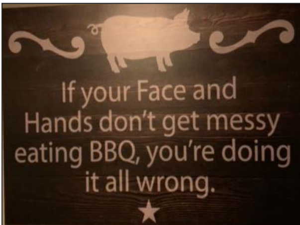
Words to eat by – photo taken by The Stewarts at the Alamo in Brookline, NH