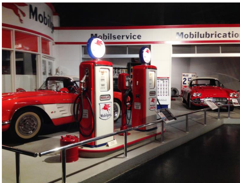
One of the many displays at the National Corvette Museum