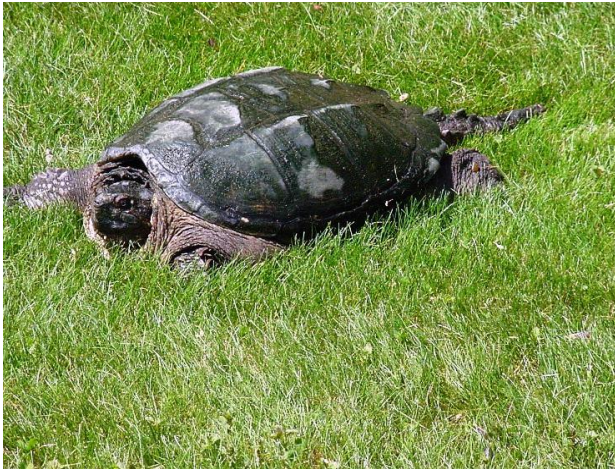
Not everything is fast at the Whittier's