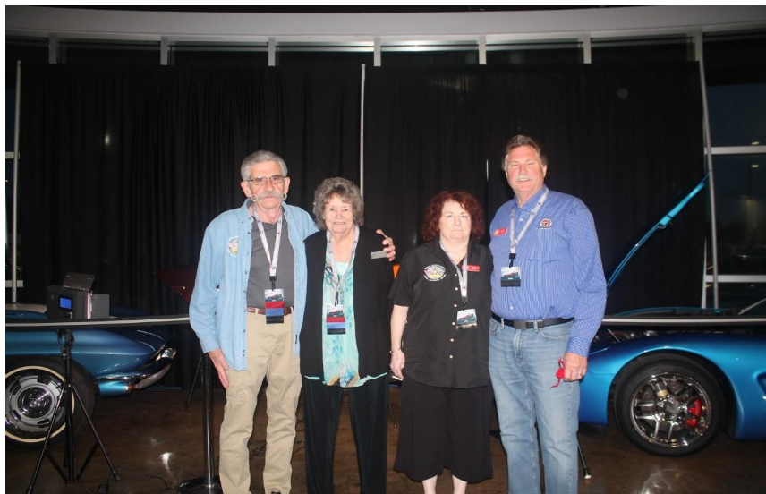
Winner's Circle Awards