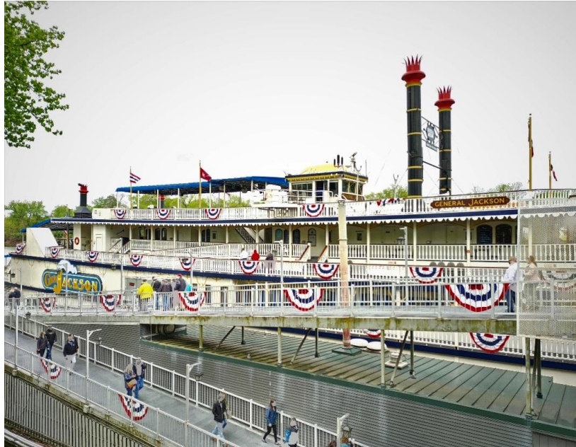
General Jackson Showboat, Nashville, TN