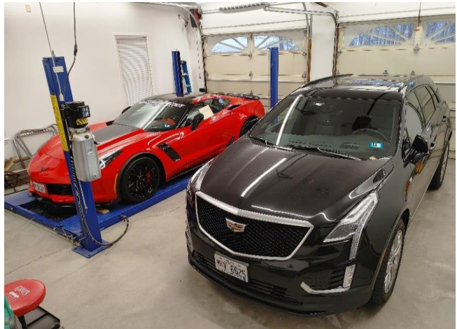
Well, both are ready to head out

Once the Cadillac was packed, we left for our first stop in Scranton, PA. On the highway there was a lot of slush and with the temperature at 32 degrees, the Corvette would not have done well. We had snow then rain/snow, turning to rain out into New York State.