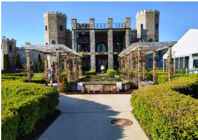
Kentucky Castle – Lexington, KY

Next day we would have breakfast at the Kentucky Castle in Versailles, KY. This was built in the early 1900’s as a personal residence and fell into disrepair. In the early 21 st century the castle was purchased and restored and is now is a hotel (about 15 rooms - $300 and up), restaurant, wedding and concert venue, etc. They are a farm to table restaurant with large vegetable gardens on the property. Breakfast was enjoyed by all. We gathered for a group picture (without the Cadillac) and then departed for Bowling Green.