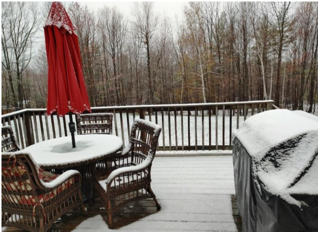
This is supposed to be April?

Given the days forecast, I transferred the luggage and other items from the Corvette to the Cadillac.