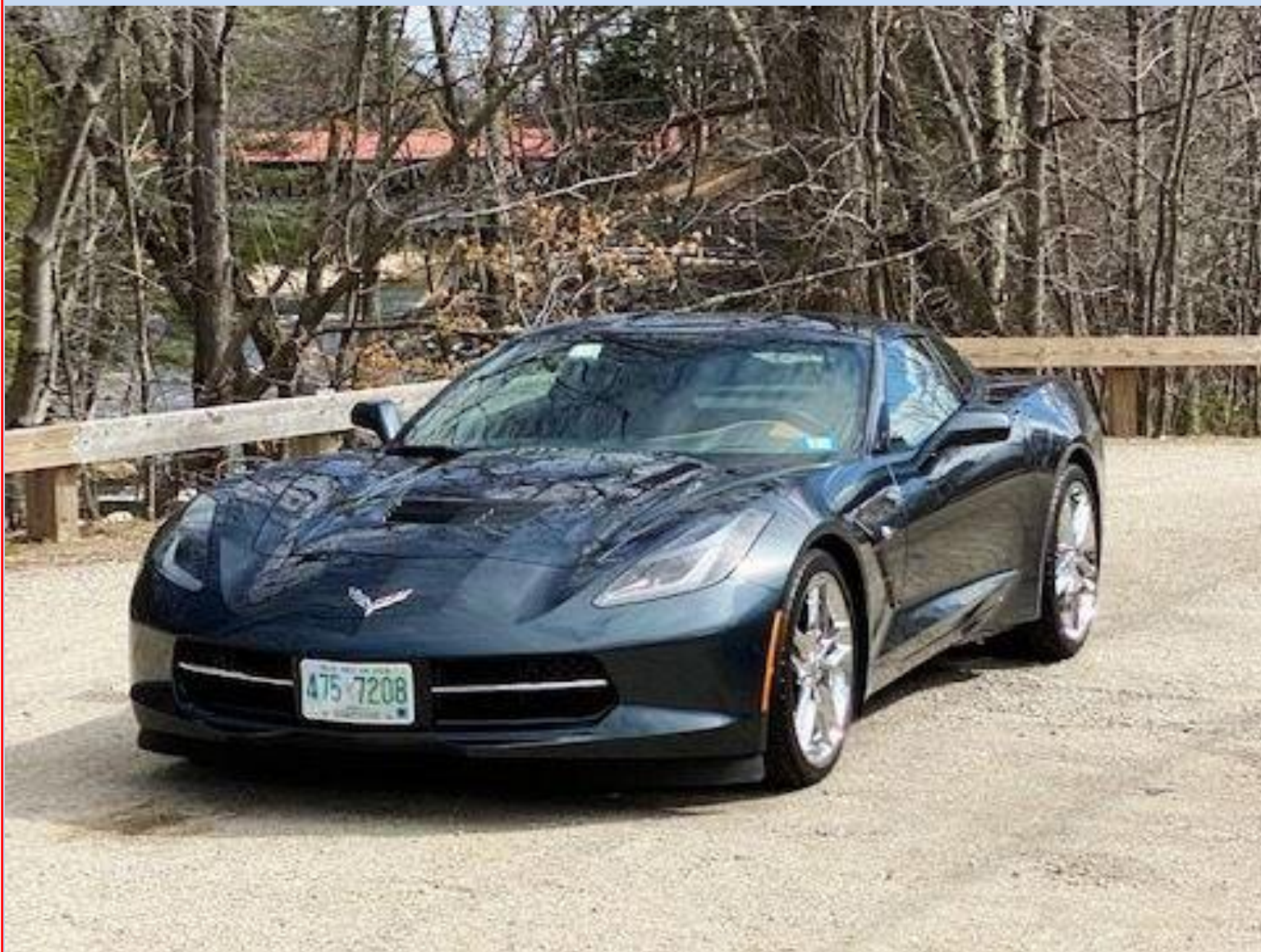
Tom & Liz Stewart's 2019 Shadow Gray Metallic Stingray In the background: Saco River Covered Bridge, Conway, New Hampshire