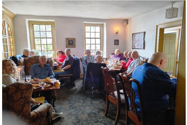
Dash to the Bash group at Dobbins House

onto US 33 west, which is one of many roads that provides many tight turns with a lot of elevation changes. On the route we stopped at Seneca Rocks (destination for rock climbing and a picnic area) where we ate our box lunches that we picked up at the hotel in Gettysburg. After lunch we proceeded on to Stonewall Resort. On the way to Harrisonburg, one couple got confused and ended up on I-70. Instead of the fun drive on US 33, they proceeded to the resort.