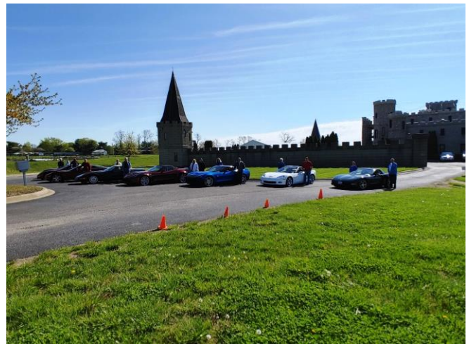
Group photo at Kentucky Castle

Arriving in Bowling Green we stopped at the National Corvette Museum, saw 5 new C8’s ready for Museum Delivery, then went through the museum to see the new “Rat Fink” display of Ed “Big Daddy” Roth creations. From the museum we headed for the Holiday Inn Hotel, registered, then met the group for dinner at Montana Grill (Tuesday is all you can eat ribs night).