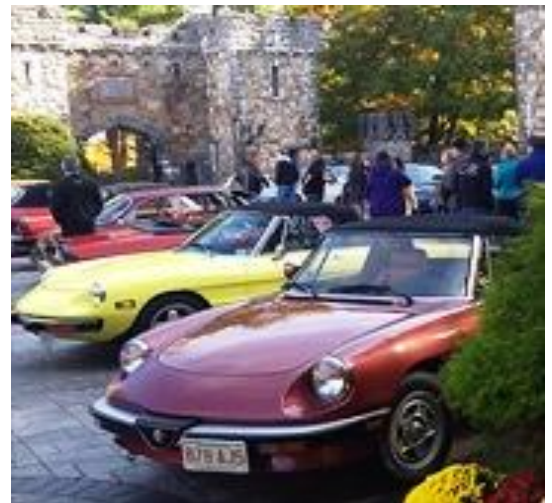
Figure 5 Our Alfa in the Courtyard

One last item. Veloci Imports owner, Jo Mount, brought his wife 'newly purchased (with some consultation from our own Al Whittier) 1964 Corvette convertible. It is silver with red interior.