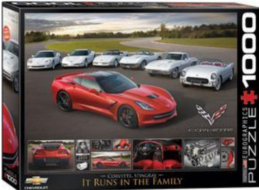
C7 Stingray 1000 Piece Puzzle $24.99

https://www.corvettestoreonline.com/collections/gifts-under-50?page=3