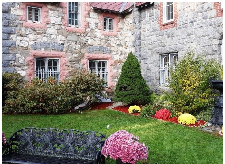
Figure 7 Castle Wildlife