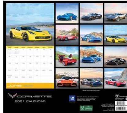
Corvette 2021 Calendar $14.99