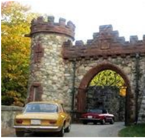
Figure 3 Driving up to the Courtyard