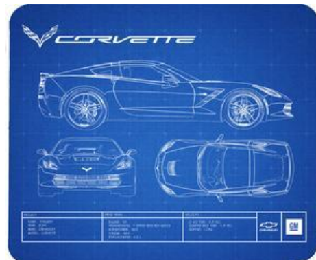
C7 Blueprint Mouse Pad $16.98