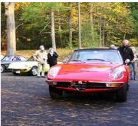
Figure 2 Arriving at Searles Castle

Everyone was to meet at the castle parking area at 8 AM – this was a challenge as the early morning temperature was 32 degrees F. The Spyder has a 4-cylinder engine and runs cool, meaning there would be little heat during the cruise. About 15 minutes before arriving we could sense a little heat but not enough you warm us up. When we arrived, there were about 12 Alfa's in the parking lot, and in the end, there were about 20. Not having been around a gathering of Alfa's, it was great to see all the various models.