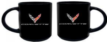
C8 15 oz. Ceramic Mug $19.98