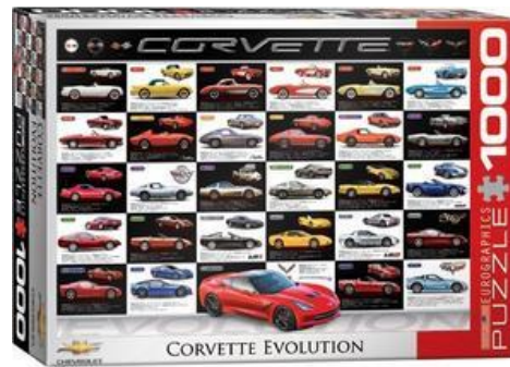
Corvette Evolution 1000 Piece Puzzle $24.99