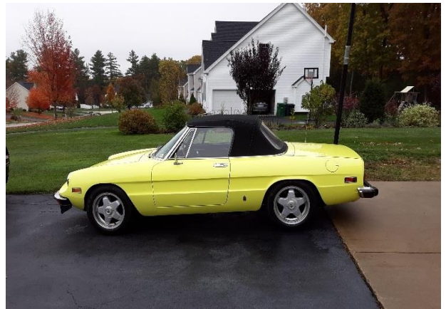
Figure 1 Our 1974 Alpha Romeo Spider

Several weeks ago I got a call from our Alfa maintenance and restoration shop, Veloci Imports, that AONE was having one last event for the year – cruise to Searles Castle in Windham, NH for coffee, a tour of the castle, and a chance to win door prizes. Given there has been little in the way of events we decided we would attend the castle cruise. NOTE – This would be the first event we have attended in all the years of being members! Through all the years we were busy attending Corvette function and events and working on the 2014/2019 NE Caravan committee.