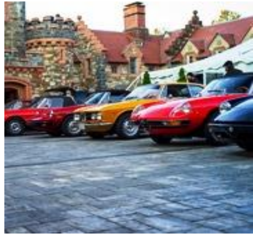
Figure 4 Parking in the Courtyard

After the overview we walked through the castle. It is in exceptionally good condition and as we walked through the rooms, we were reminded of the tours we have made of castles and estates in England and France. It was quite enjoyable.