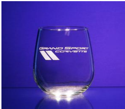
Stemless Wine Glasses (2) $27.98