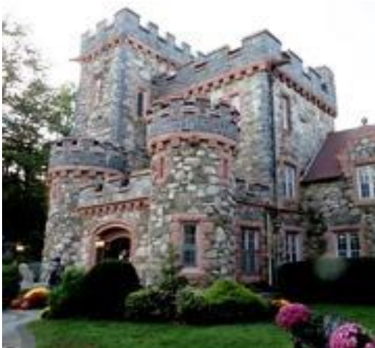
Figure 6 The Castle