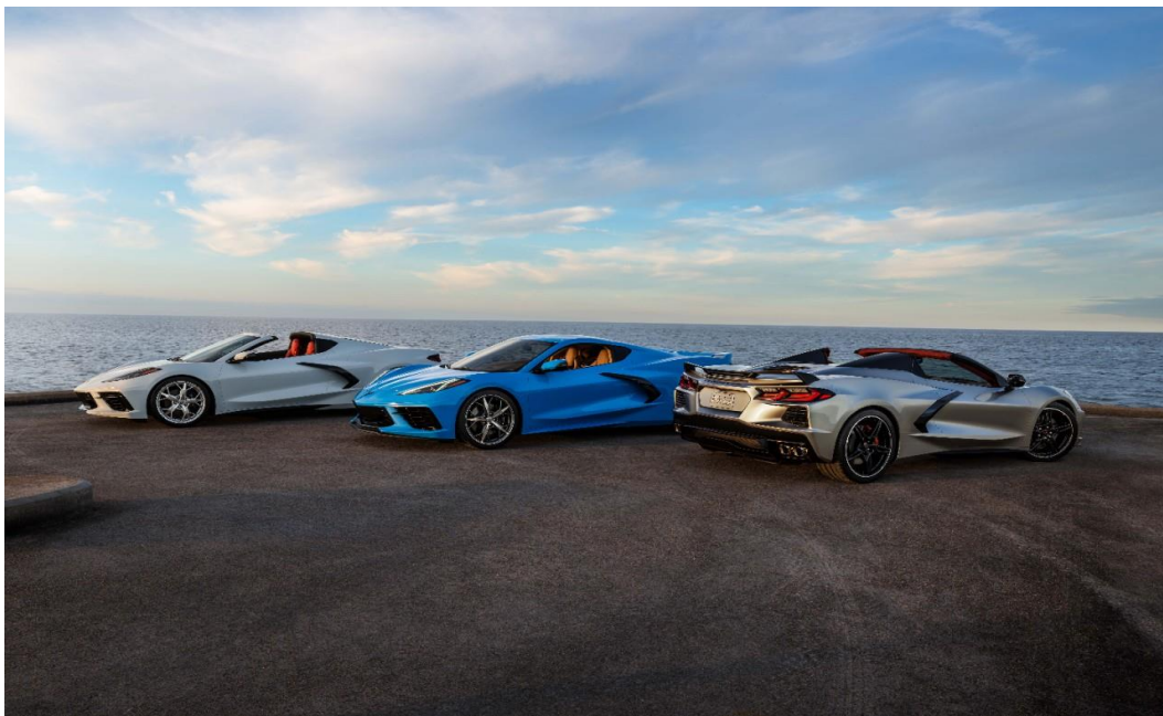
2021 Chevrolet Corvette Stingray Coupe and Convertible (far right in new Silver Flare Metallic)

Corvette has always represented iconic American design, performance, technical ingenuity and attainability. The 2021 Chevrolet Corvette Stingray retains carryover pricing – the same as the introductory model – with MSRP starting at $59,995 for the coupe and $67,495 for the convertible. Both models include destination freight charge.