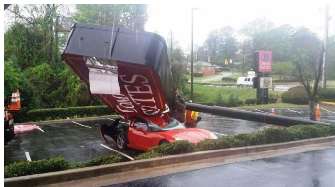
HOW WAS YOUR DAY, DEAR?

August 26th is the next scheduled virtual meeting; followed by: September 9 th and September 23 rd .