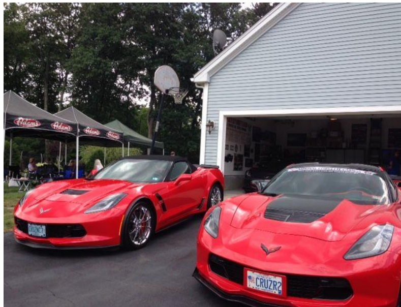
Red Corvettes at the GCCC Annual Picnic

Gate City Corvette Club is one of the hundreds of Corvette clubs throughout the United States and Canada. The purpose of GCCC is to make being a Corvette owner more fun. GCCC meets at 7:00 pm the second Friday of the month at MacMulkin Chevrolet, 3 Marmon Drive, Nashua, New Hampshire.