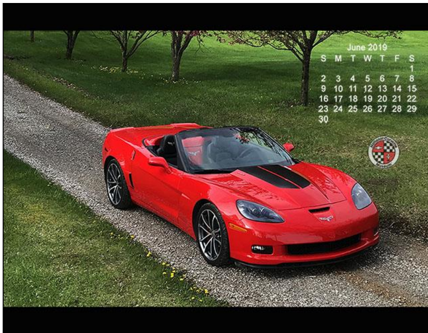
Figure 1 Calendar

These dates are for club events where we want to ensure as many members as possible are available to participate. Please keep these in mind when making your Corvette season plans.