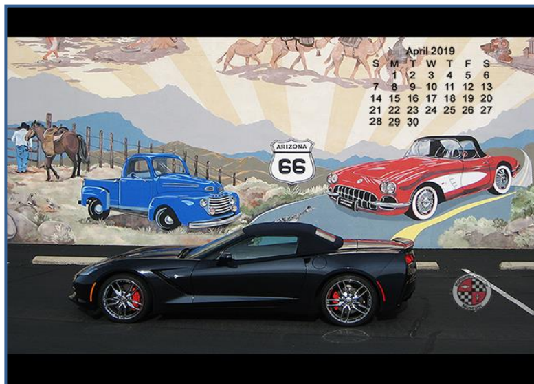
Figure 1 Calendar courtesy of The National Corvette Museum

These dates are for club events where we want to ensure as many members as possible are available to participate. Please keep these in mind when making your Corvette season plans.