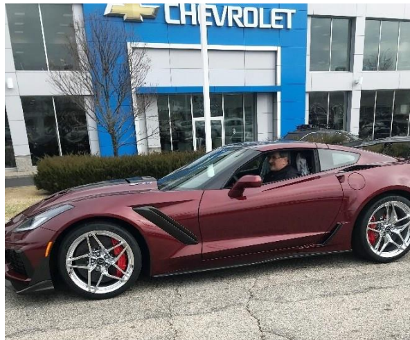
The new ZR1!