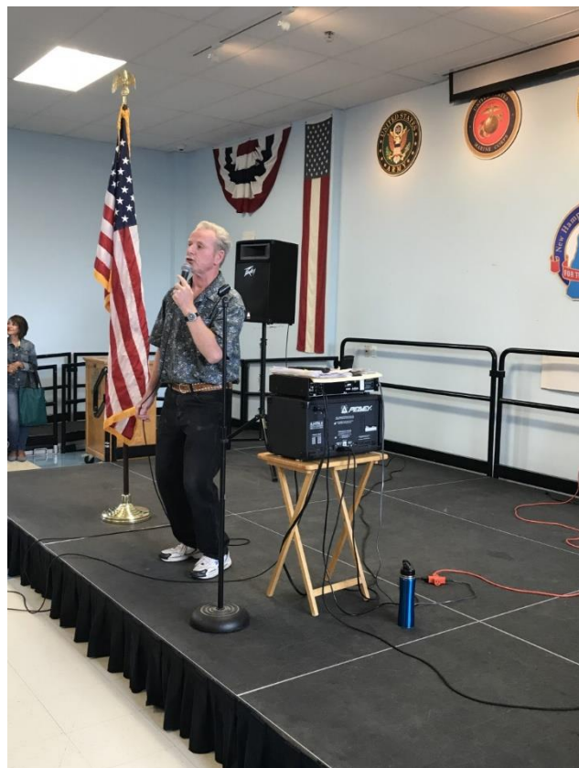
Below: Our entertainment, singing the hits!