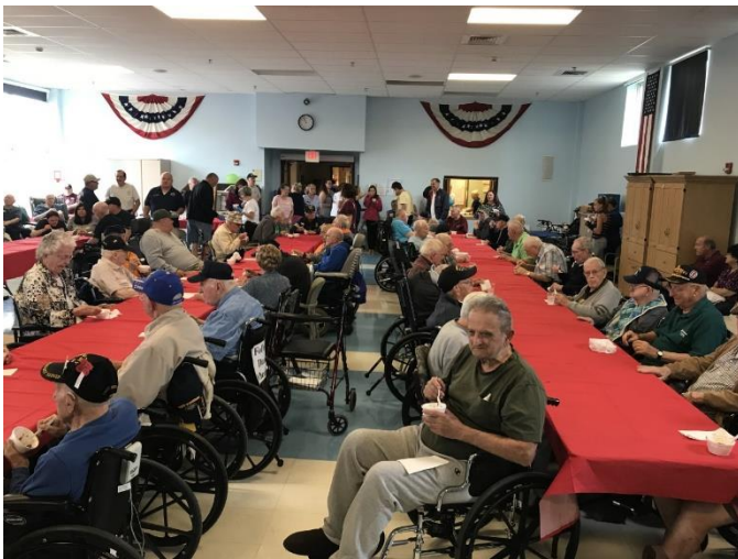
Everyone Getting their Ice Cream

The entertainment was a real hit, getting the veterans to sing along with some great classics, and ice cream sundaes were made & handed out to all present. Everyone had a great time, and we raised around $2,200 in cash donations and many bags of supplies for the sunshine cart. It always makes me proud to see the difference a few people can really make in these folks' lives, and the support from people who really work hard to support out veterans whenever they can. Thank you to everyone who came to support this event, especially with such lousy weather!