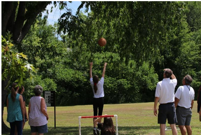
Spectators Watching Attempted Tree Recovery