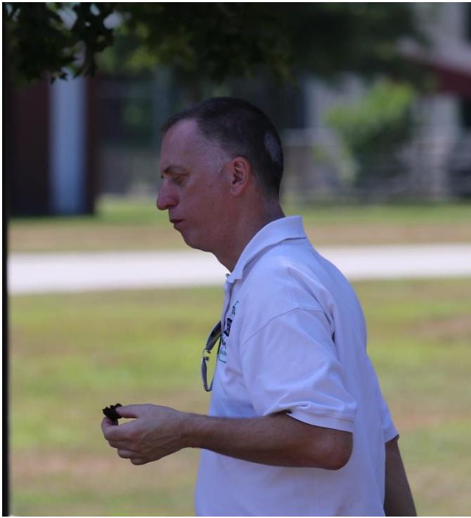
What's in this Brownie?