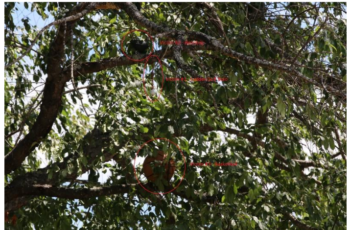
It Didn't Go Well for a While (3 fails)