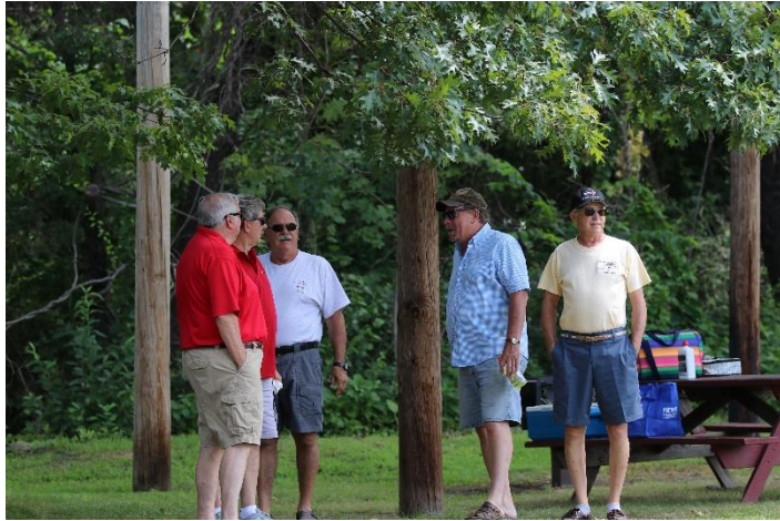
Hanging out & Chatting