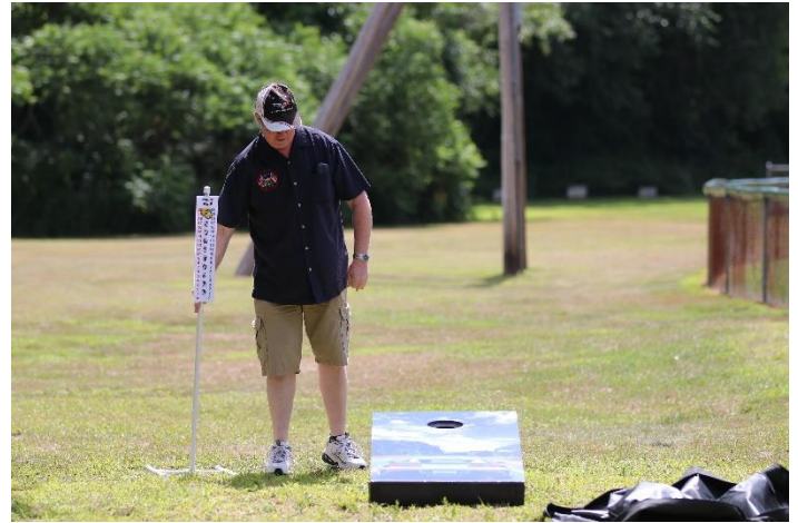
Setting up Cornhole Game (Vette Themed!)