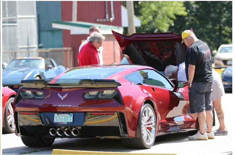
Analyzing Joe's Engine Bay