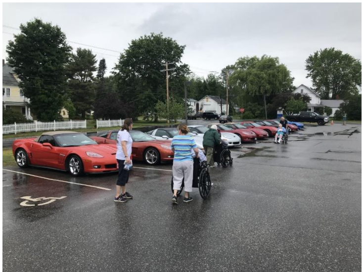
Above: Veterans brave the weather to see the Vettes!