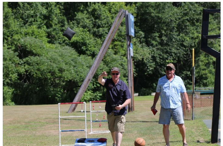
Cornhole in Action!