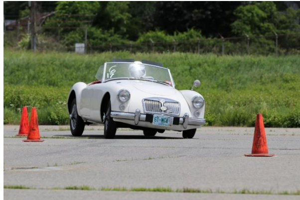
A 1960 MGA