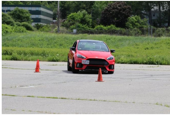
This Ford Focus RS was Quick!