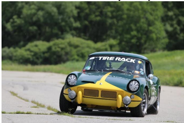
Modified for the Track - Triumph Spitfire GT