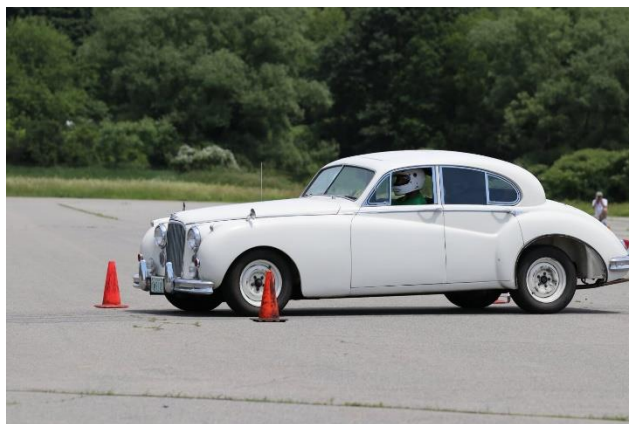
Classic Jag Can Still Run the Cones!