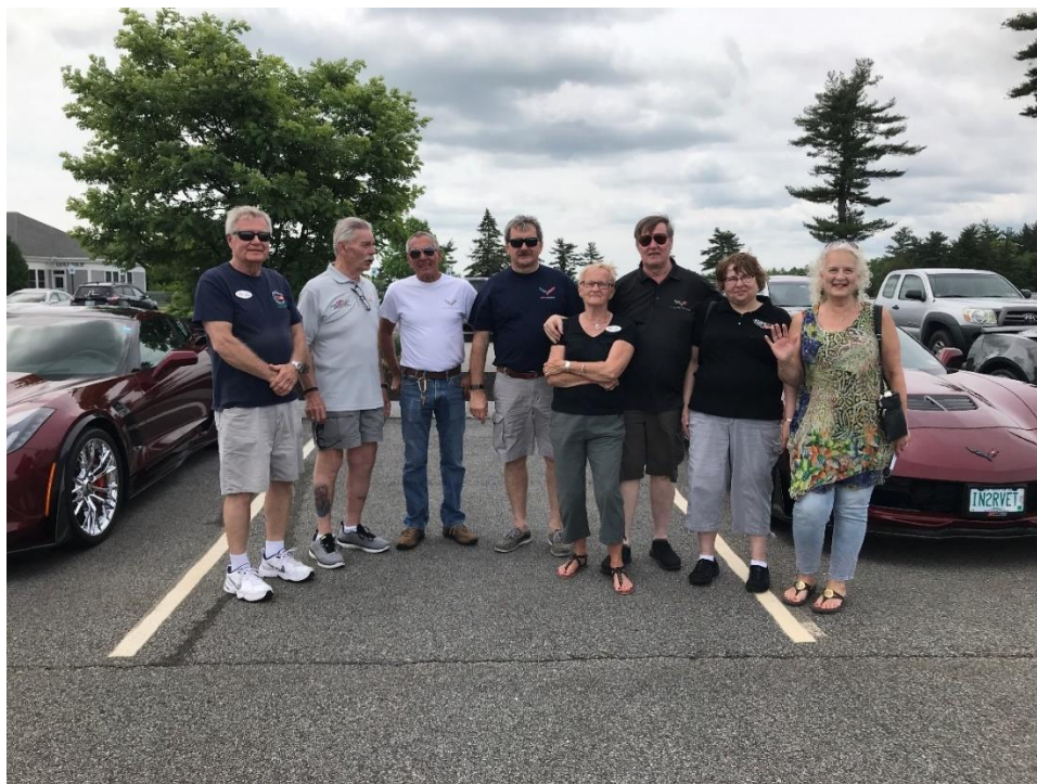
Corvettes, Coffee, and Gate City!