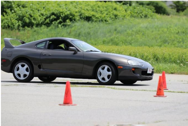
A rare non-modified Toyota Supra