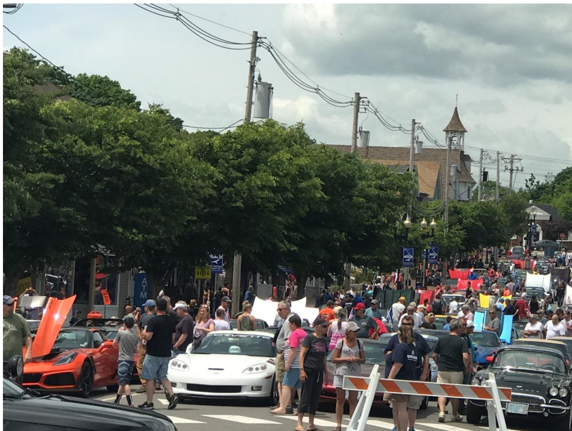
Hey, I think we recognize that orange car at the very front of the pack at Back to the Beach!