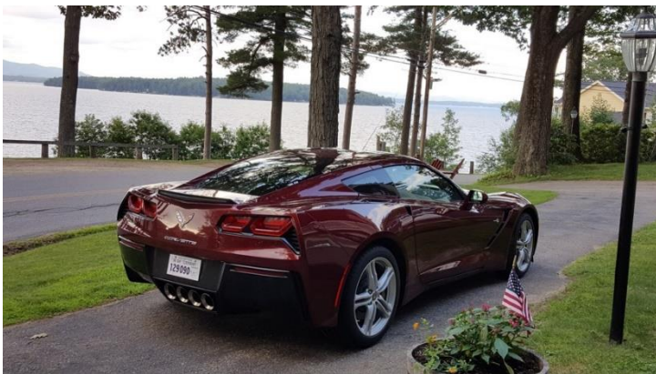
Here it is on a trip to Lake Winnepesaukee.