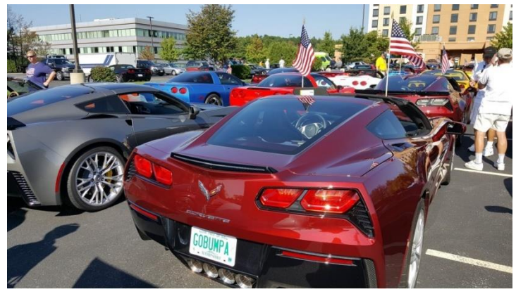
Our first Gate City Club Event Vet for Vets