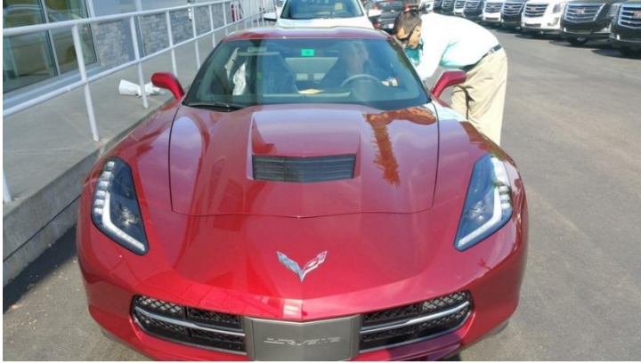
Getting my new car briefing at MacMulkin this past June.

My First Corvette, a 2017 1LT Stingray Coupe, 1LT, Manual, Long Beach Red.