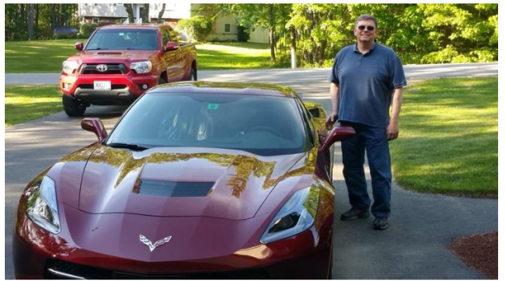
Tacoma out of the garage, priority to the Corvette.