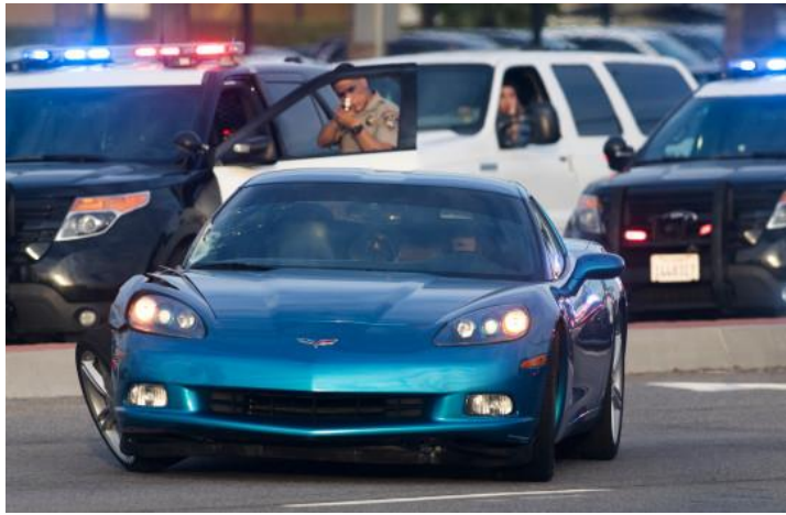
https://www.ocregister.com/2018/01/29/chp-in-standoff-with-pursuit-suspect-near-santa-ana-auto-mall/ - Photo credit: Paul Bersebach, Orange County Register/SCNG)

This poor blue C6 found itself with a dislocated front passenger side wheel, after being involved in a high-speed car chase in California. The CHPs observed the woman driver taking the Vette at speeds around 100mph on the freeway. When they tried to pull her over, she decided to try and outrun the law. As she left the freeway and entered local roads, she hit a sedan leaving a local auto mall, damaging the Vette as can be seen here. As you can see, the police were not amused at her attempted high-speed run.