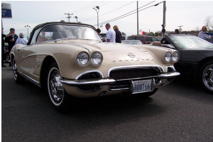
From Calloway Day at Corvette Mike New England, 2009