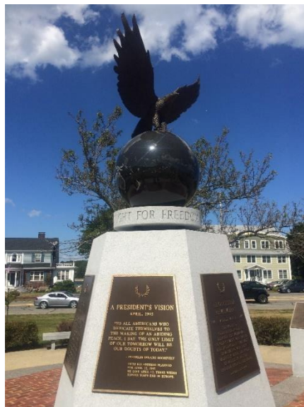
The Gloucester WWII Memorial