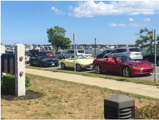
We Found Some Short-Term Parking