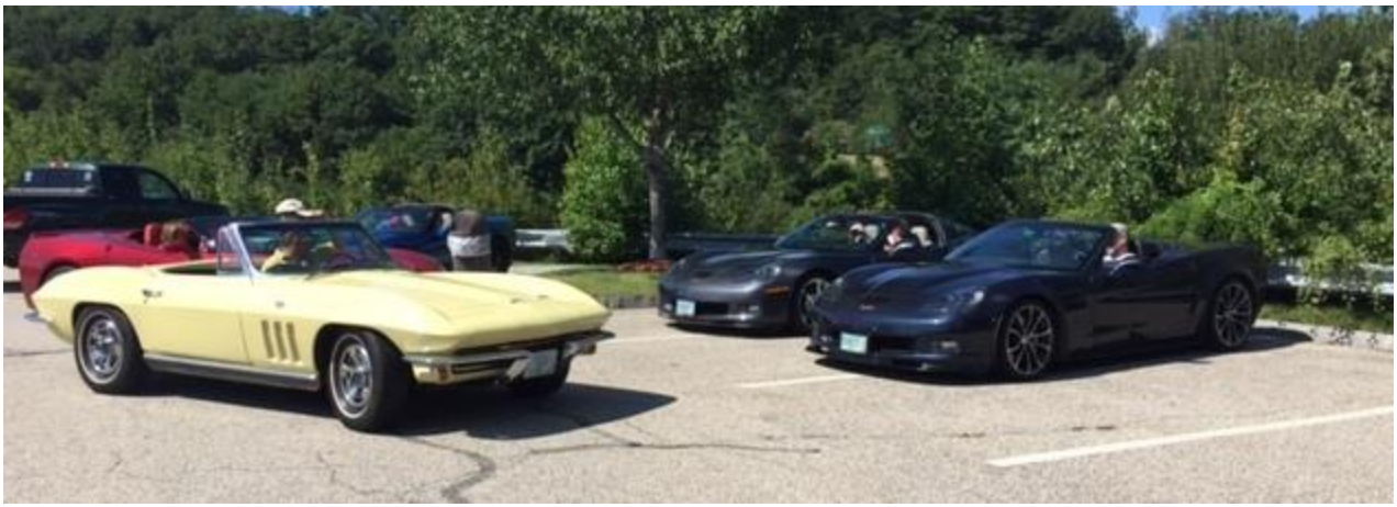
Getting Ready in the Parking Lot