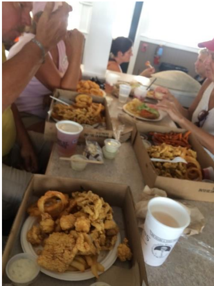
Fried Seafood for the Win!