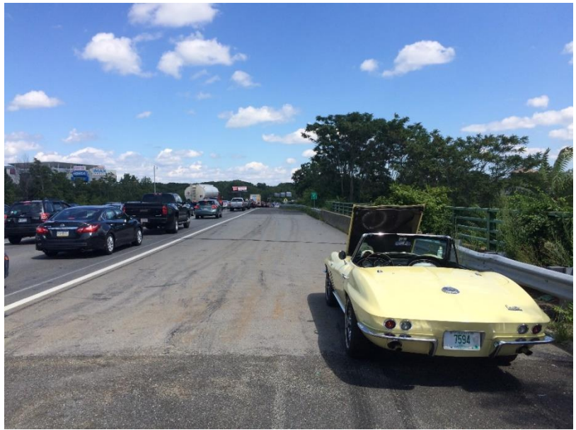
Our Club's Own "That Poor Vette"!