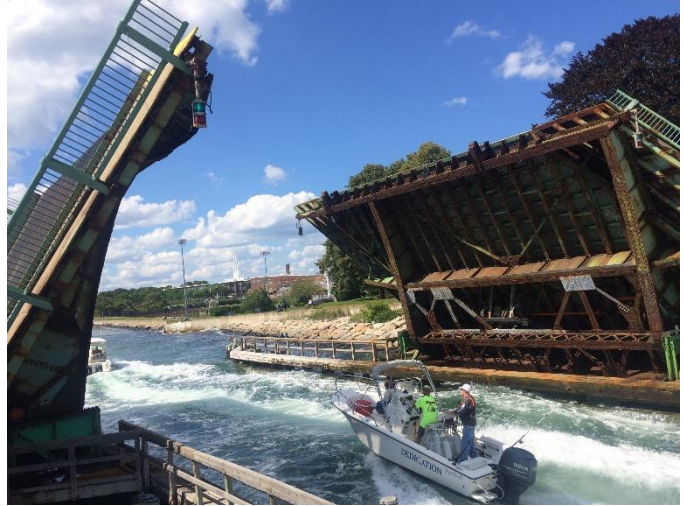
We Dared Jimmy to Jump the Drawbridge