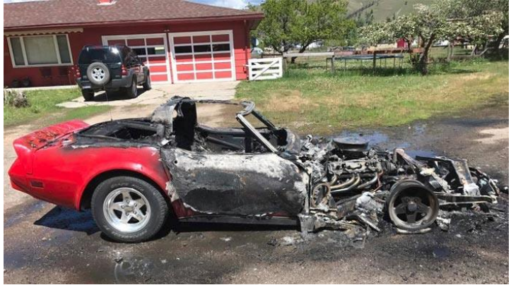
http://www.corvetteblogger.com/2017/05/22/accident-a-ruptured-fuel-line-causedthis-c3-corvettes-engine-fire/ - Photo credit: kpax.com