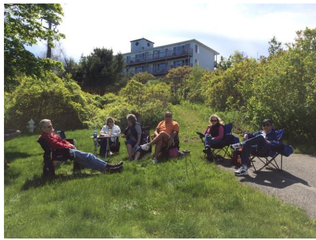
The Greeting Crew