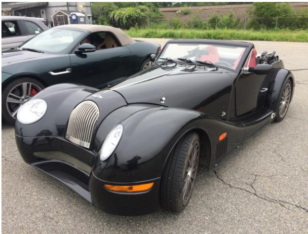
2005 Morgan Aero8