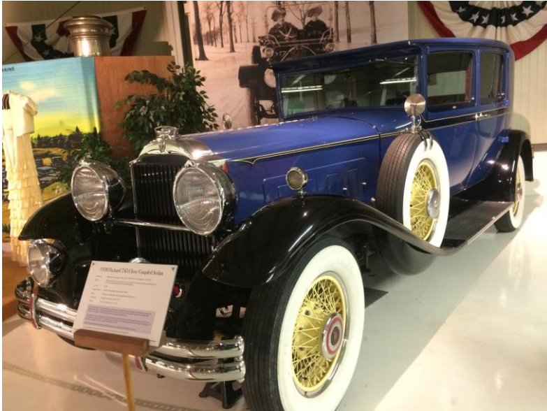
Gotta Love the Packards!