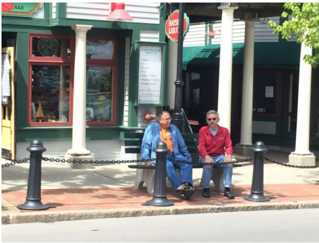
Waiting for the Shoppers

Later we cleaned cars, then all met on the "green" in front of the hotel, set out our chairs, and proceeded to imbibe and greet the attendees just arriving. This has become an annual ritual for our group the past several years. Late in the afternoon we attended the mini-Meet and Greet, and afterward we decided to head out to the Tan Turtle in Northeast Harbor for dinner. After dinner, we went back to the hotel then met in the Piano Bar at the sister hotel next door, the Blue Nose, for after-dinner drinks and to listen to the piano player.