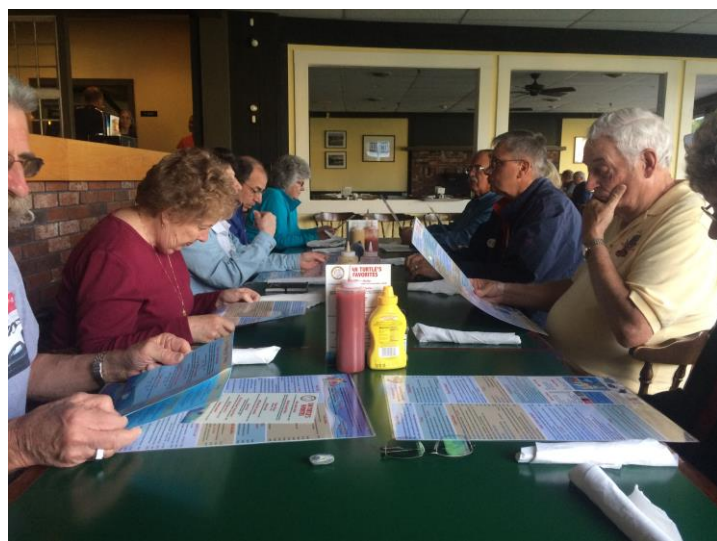
Dining Choices at the Tan Turtle