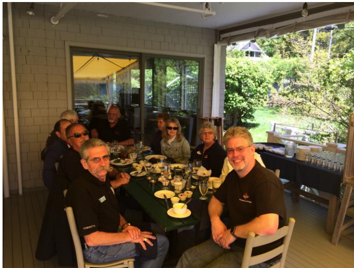
Enjoying Another Meal!