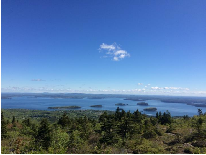
The View from Cadillac Mountain