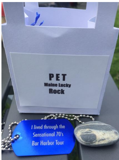
In Our Goody Bags!