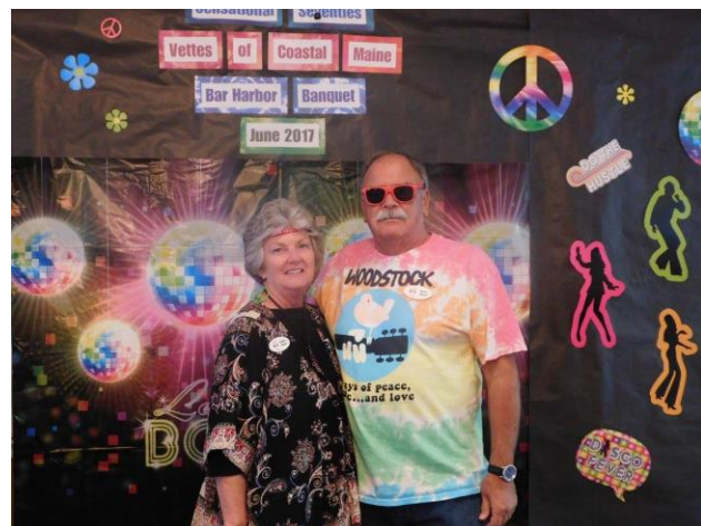
A Pair of Groovy Hippies

Sunday morning saw some of our group head out early while others packed, had breakfast, then departed. Each year we re-book the room we had to ensure we have the room again. Again, this was a great event, Bar Harbor is a beautiful area to enjoy and Acadia National Park is a great place to enjoy nature. We will be back next year and hope to have more GCCC attendees.