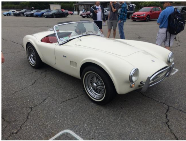
1964 Shelby 289 Cobra