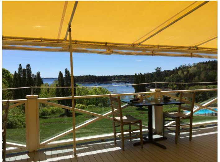
The View at the Asticou