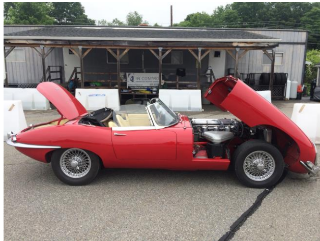
Love the Old Jags