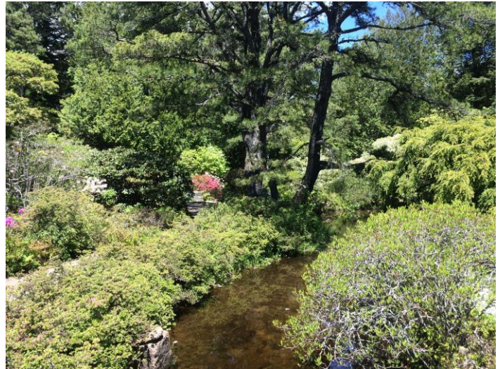
The Asticou Gardens

Saturday morning is the Car Display on the downtown ball field. After breakfast at the hotel, we headed to the ball field where we were parked into our respective classes, and proceeded to pick our choices of best cars in the various classes. During the process, door prizes were called out, then at 11 AM sandwiches and salads were delivered to those who ordered them. The car display had to be off the field by noon so some went on the cruise of island, while others went on their own for other adventures. Our group decided to head out to see other areas of the island and ended up for lunch at the Seafood Ketch in Southwest Harbor. This was a great find and all enjoyed their lunches. After lunch, some headed back to the hotel while a few of us headed to Seal Cove to visit the Seal Cove Auto Museum. This is a small museum but the collection there is well worth the visit. After the museum, we headed back to the hotel where all were readying