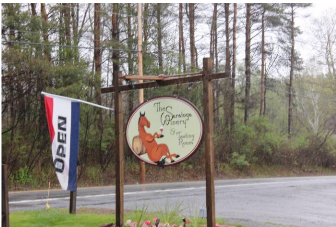
The Saratoga Winery!