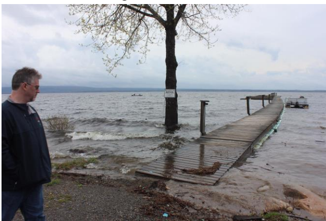
The water on the lake was a bit choppy...