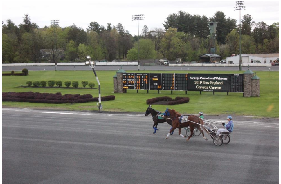
We enjoyed a fun night of harness racing at the Saratoga track