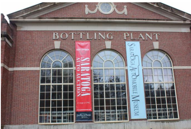
The Saratoga Automobile Museum