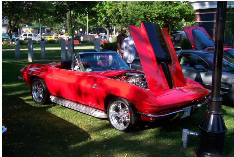
Photo from 2010 Elm Street Show in Manchester