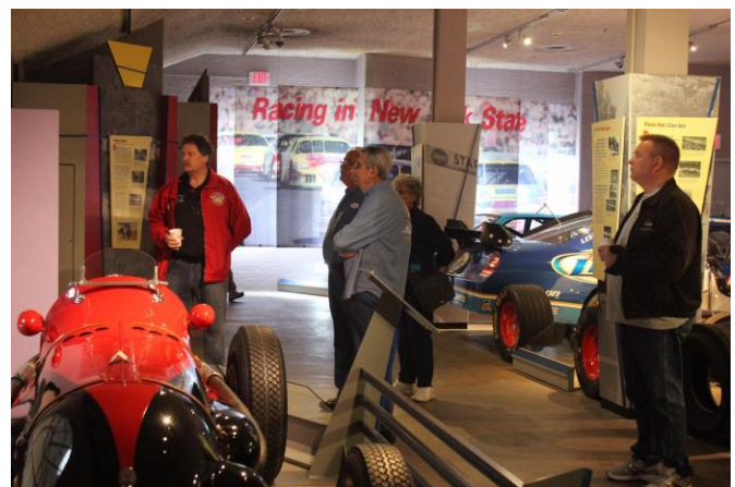
Learning About Racing in New York