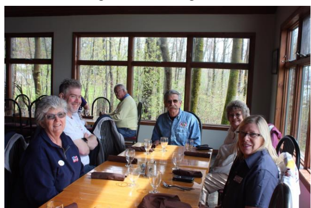
Happy for the meal coming shortly!