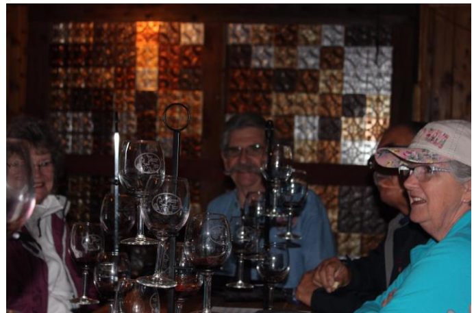
There was much wine tasting to be had!