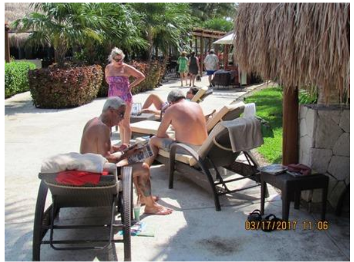
Getting Ready Pool Side

During the day, breakfast and lunch were offered in the buffet restaurants or you could catch a burger, hot dog, or other offerings in the pool side grill area. In the evenings, we had our choices of restaurants – Italian, French, Mexican, Indonesian, Steak House and Seafood Grill and Japanese. We tried them all except for the Indonesian.