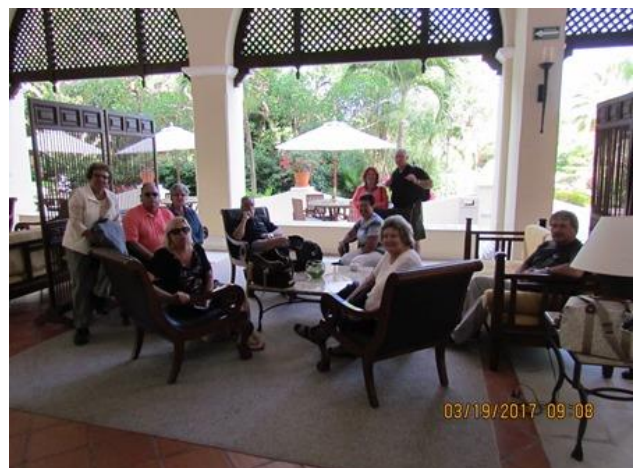
Waiting For The Bus To Depart