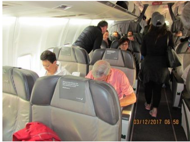
On Both Sides of the Isle

Upon landing, we found our transportation vehicle, boarded, and within 40 minutes we were at the Valentine Imperial. We were escorted to the check-in area and after waiting for over one half hour, and some upgrading their rooms, we were checked in and transported to our rooms.