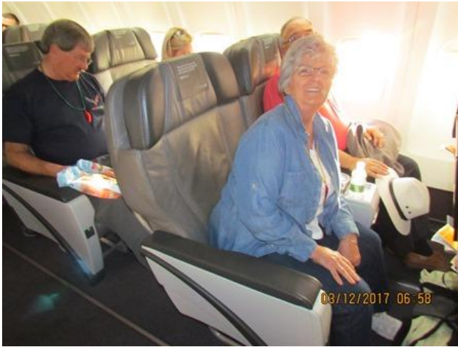
Large Seats and Plenty of Leg Room

After a number of years of doing this March trip to warmer climes, we learned to upgrade our seats to first class/business class so we would be more comfortable, and with Icelandic Air, our bags were last on the plane and first off, as we were first on and first off. Much easier!