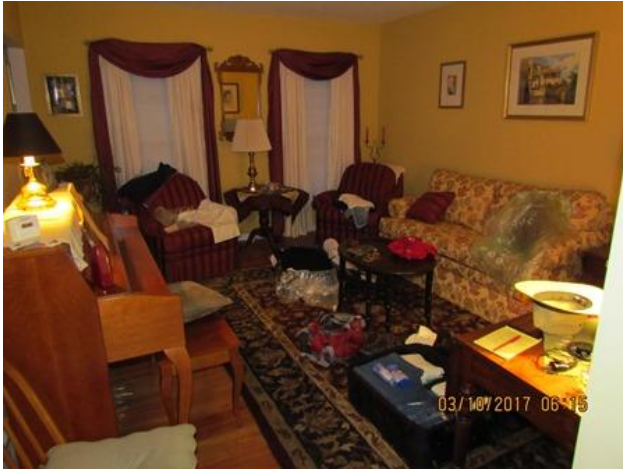
Packing Takes Plenty of Space

Logan Airport. It was suggested that some carried 'bricks' in their luggage to help with the wall building effort on the border.