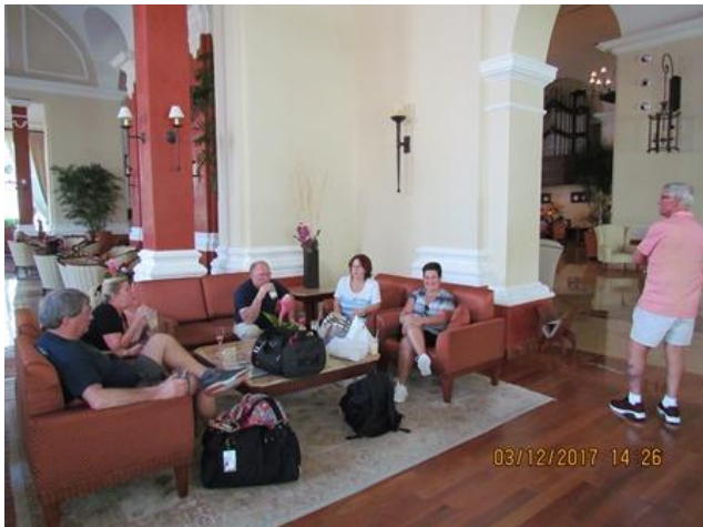
We Wait to Check In

Upon landing, we found our transportation vehicle, boarded, and within 40 minutes we were at the Valentine Imperial. We were escorted to the check-in area and after waiting for over one half hour, and some upgrading their rooms, we were checked in and transported to our rooms.