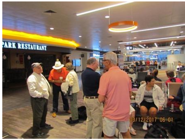
At the Airport We Wait, And Wait