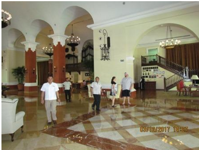
The Reception Area