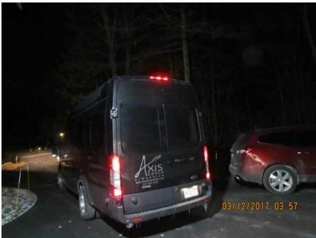
Our Chariot Has Arrived