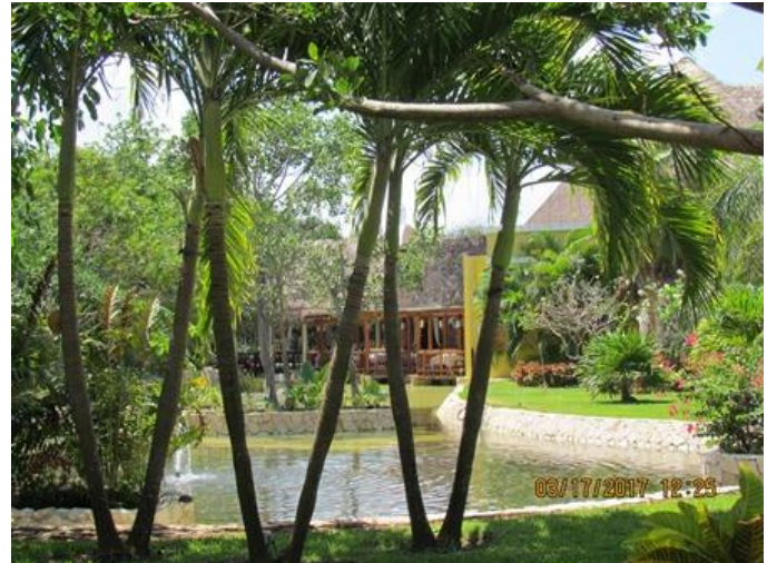
It's a Mad, Mad, Mad World