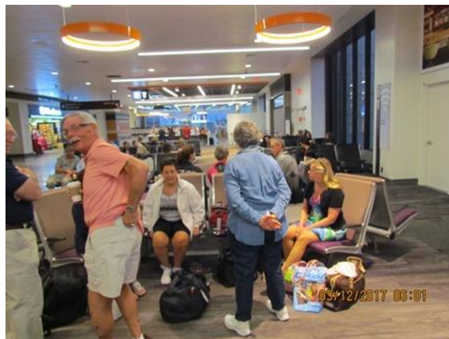
Something About Being Too Tight?