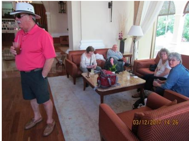
And We Drink While We Wait

The daily routine was breakfast, poolside, lunch, pool side, discuss where we would have dinner each evening, break to get ready for dinner, and then meet at the restaurant for dinner. Next day, the same as the first, sunny, warm, blue skies, and turquoise water. During each day, there were side adventures to take, walks along the beach, trips to the local town of Playa del Carmen, and entertainment at night.