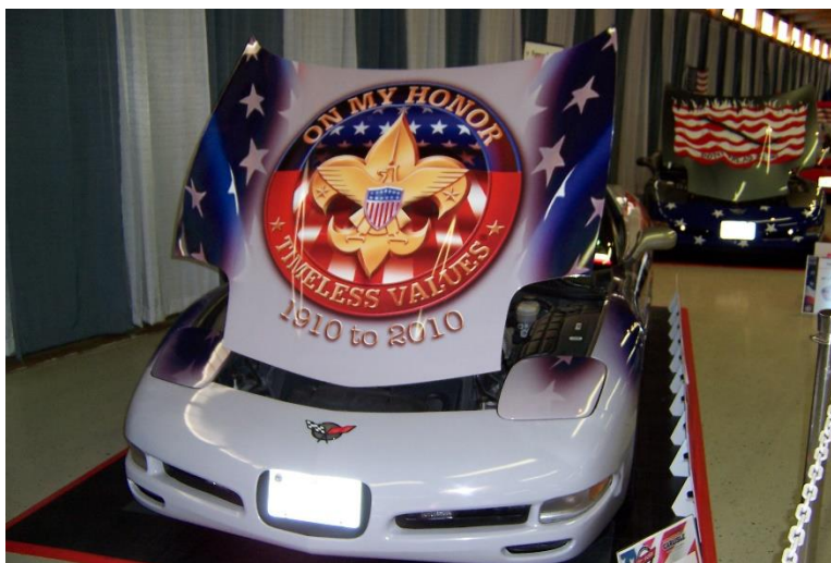
Photo from 2010 Corvettes at Carlisle