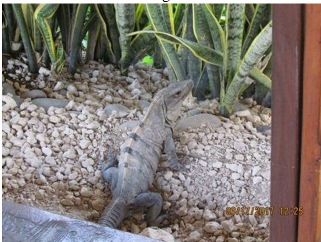
A Local Resident