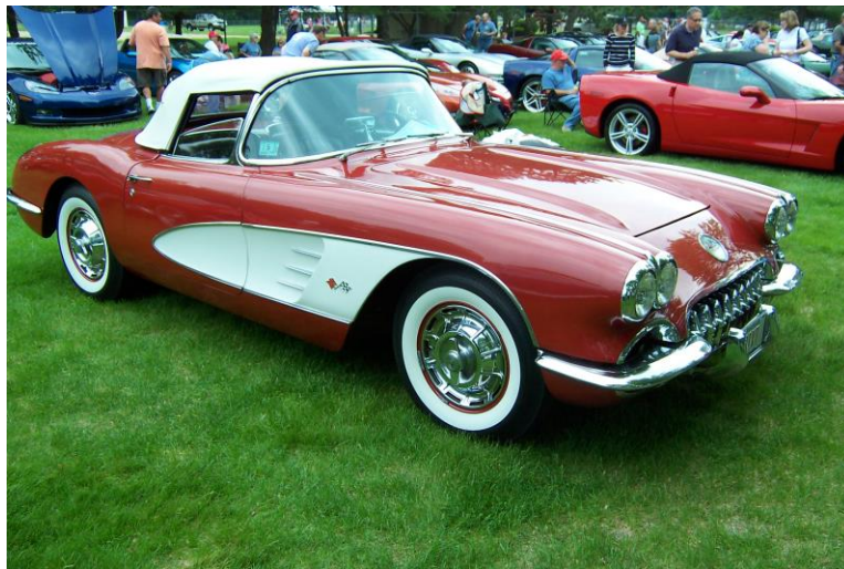
Photo from 2009 Spring Fling