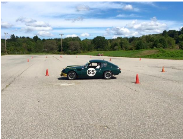
Triumph Spitfire GT