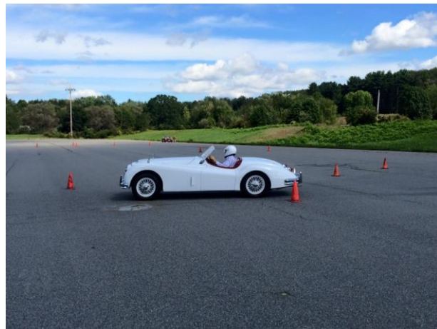
Classics always Look Awesome