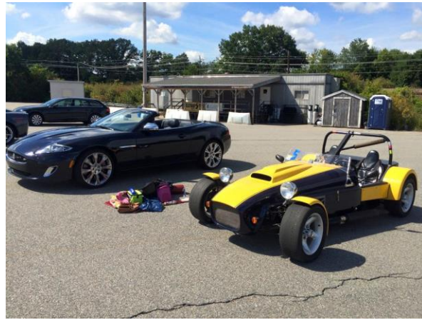
Jag F-Type and Stalker Lotus 7 Kit-car