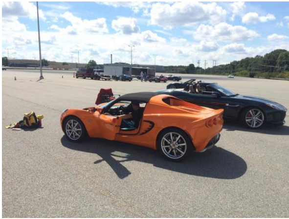
Lotus Elise & Jaguar F-Type R