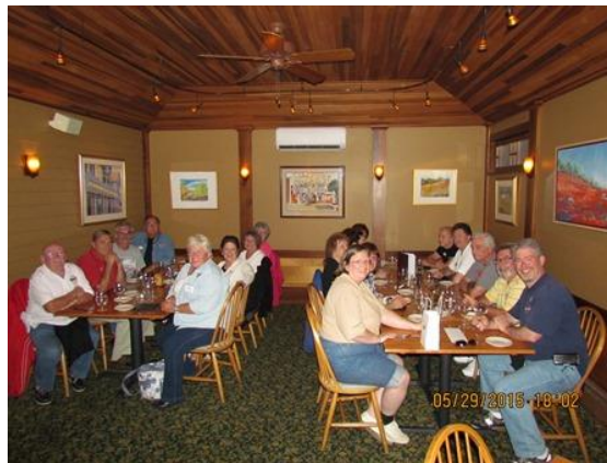
Figure 7 GCCC Plus at Galyn's

After lunch some went on a drive to the top of Cadillac Mountain and others went elsewhere. Later in the afternoon our "Homeless" group again staked out our turf and enjoyed refreshments. Later we headed downtown and had dinner at Galyn's. Dinner was enjoyed by all.