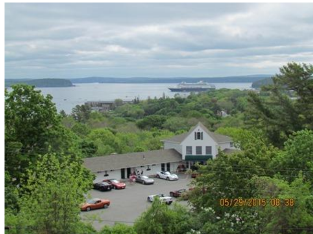
Figure 2 View From The Top of a Cruise Ship in the Harbor

After everyone was checked into the motel and unpacked, found Ruth and Amos, then we gathered for refreshments and decided on McKay's for dinner.