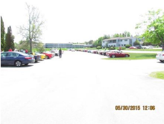
Figure 10 Cars Parked at Northeast Harbor

Later in the morning, pre-ordered sandwiches were delivered, and after most consumed their lunch, we headed out for a coast line cruise to Northeast Harbor. We do this every year and it never gets old. After the cruise, most of us returned to the motel to get ready for the evening's Banquet. The theme this year was R&R and attendees were asked to dress accordingly.