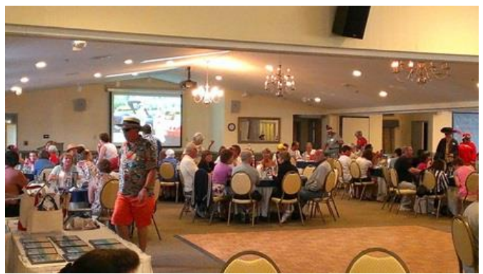
Figure 12 The Banquet