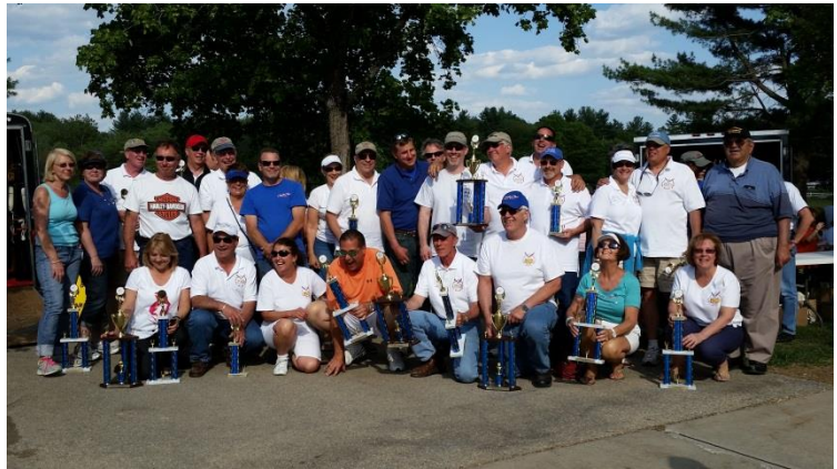
Corvette Club of Rhode Island Best Club Participation at Spring Fling