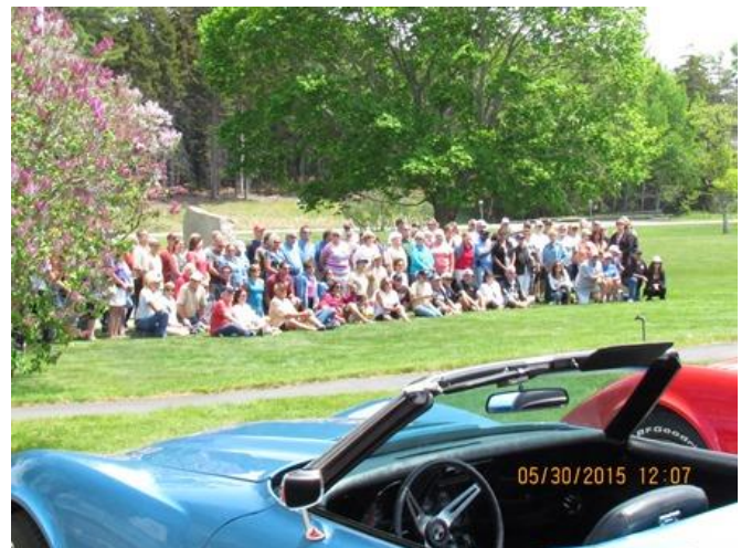
Figure 11 Group Photo at Northeast Harbor

At 5:30 PM we boarded a bus that took us to the banquet hall. Upon going inside, a picture was taken of each attendee. As we had a large group we reserved 2 tables. There was a large screen at one end of the hall where a slide show ran all evening showing pictures from many years of the event plus ones from the current one.