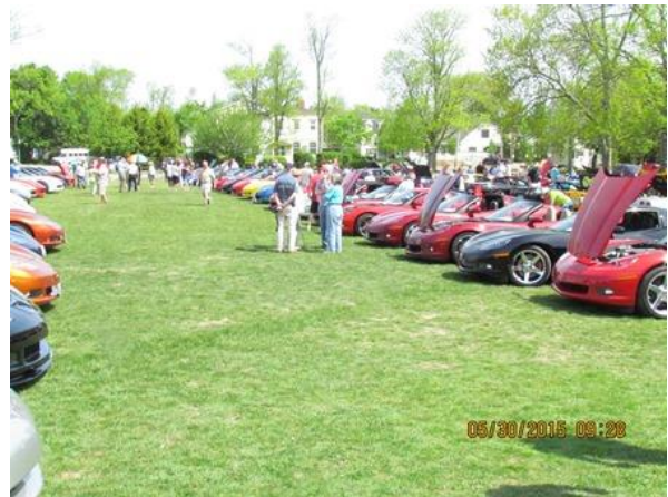
Figure 9 More Cars

Later in the morning, pre-ordered sandwiches were delivered, and after most consumed their lunch, we headed out for a coast line cruise to Northeast Harbor. We do this every year and it never gets old. After the cruise, most of us returned to the motel to get ready for the evening's Banquet. The theme this year was R&R and attendees were asked to dress accordingly.