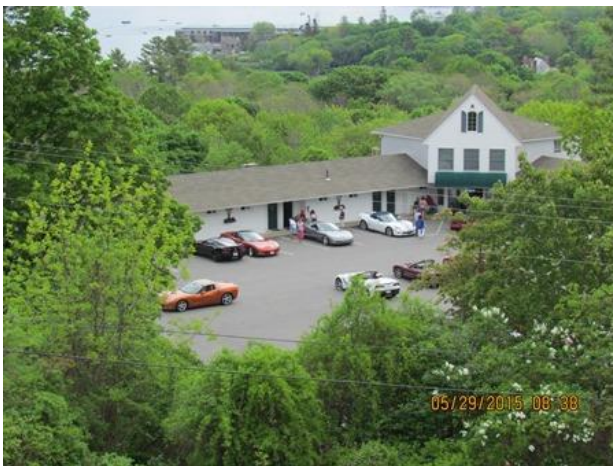
Figure 1 Wonder View Motel

Our drive would take us on the highway up to Freeport, and then we took off onto Rte. 1 along the coast. It is a slower drive than staying on the highway but the views are worth the time. In Rockport, ME we stopped at the Rockport Diner for lunch, and then we continued on to Bar Harbor, stopping for gas, National Park passes, and finally at the Wonder View Motel.