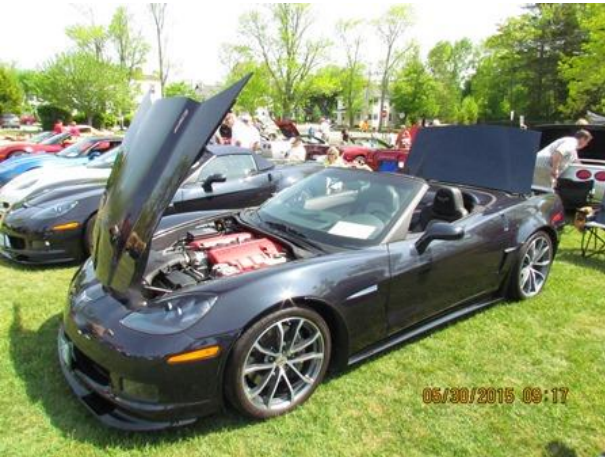
Figure 8 Car Display

Saturday was the car display day at the ball field downtown. There were over 80 cars on the field and participants were to select a car for each grouping (and not to choose their own) and winners would be announced at the Banquet in the evening.