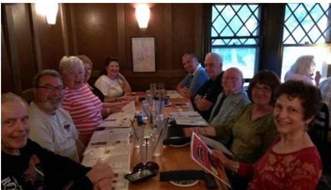
Figure 4 Table 1 Jack Russell's

For dinner, we decided to go to Jack Russell's, a steak house. While dining, a thunderstorm hit and took out the power. Thankfully, the restaurant had a backup generator and we continued to enjoy our evening.