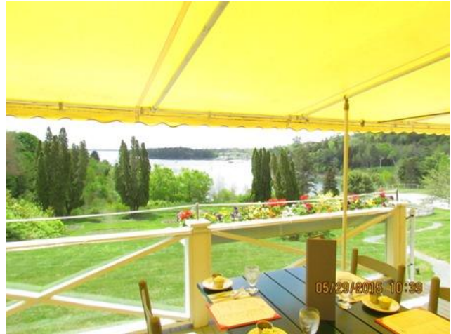
Figure 6 View From Asticou Deck

After lunch some went on a drive to the top of Cadillac Mountain and others went elsewhere. Later in the afternoon our "Homeless" group again staked out our turf and enjoyed refreshments. Later we headed downtown and had dinner at Galyn's. Dinner was enjoyed by all.