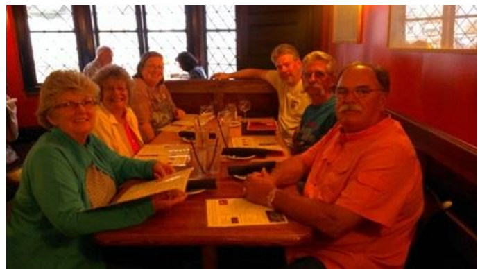
Figure 5 Table 2 Jack Russell's