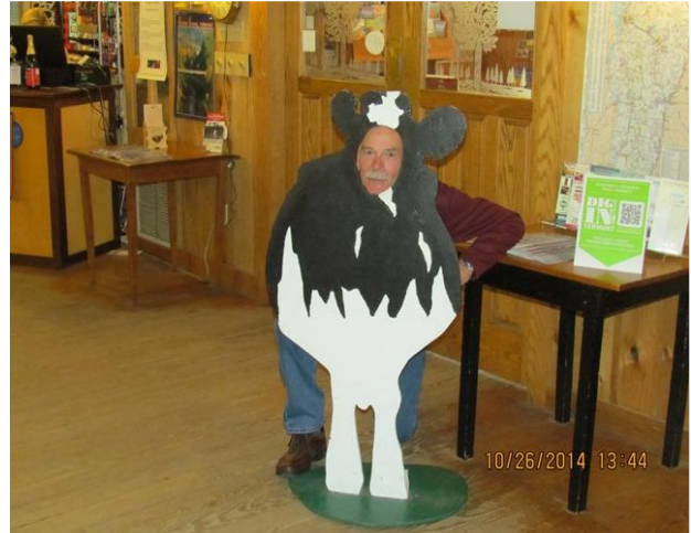
Figure 11 This cow looks familiar!