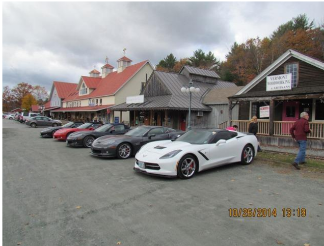
Figure 10 Quechee Gorge Village Shoppes