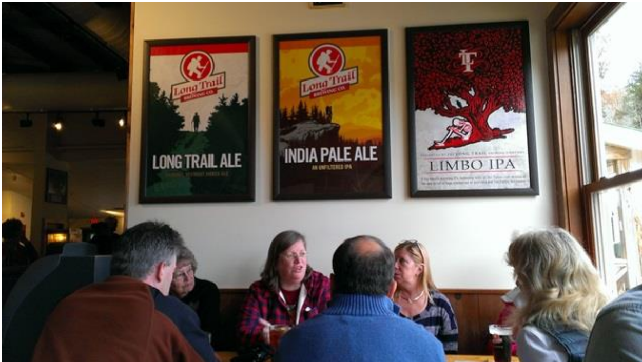
Figure 4 Yes, the Long Trail Pub

We had an enjoyable lunch at Long Trail with some of us trying their seasonal beer, which was quite good (Harvest Ale). The service was very good and the food satisfied all. There is a dining deck overlooking the river which must be quite enjoyable in the summer. We have to plan on returning.