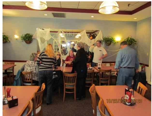
Figure 13 Ice Cream and FUN!

All agreed that we had a great time, even with the showers, and now it is time to put the cars away (washing first). Thanks to all for making this another great Gate City Corvette Club CRUISE!!