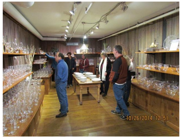
Figure 8 No One Looks Overly Excited!