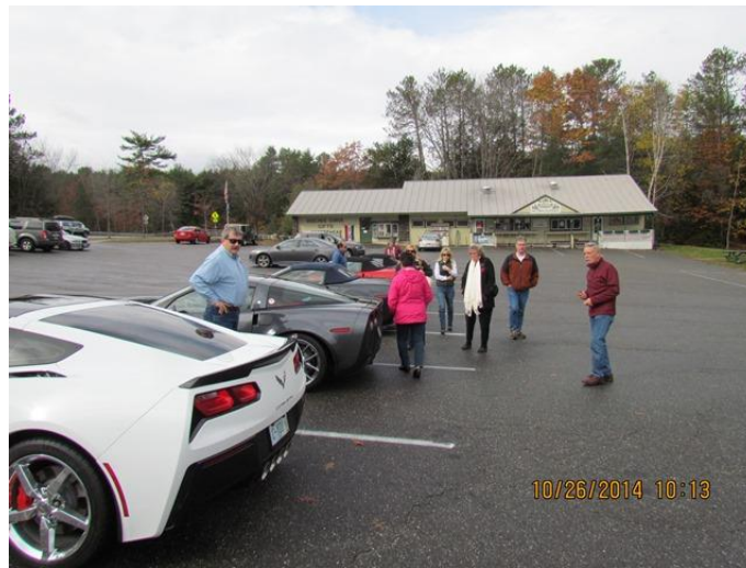
Figure 3 Pit Stop

We had an enjoyable lunch at Long Trail with some of us trying their seasonal beer, which was quite good (Harvest Ale). The service was very good and the food satisfied all. There is a dining deck overlooking the river which must be quite enjoyable in the summer. We have to plan on returning.