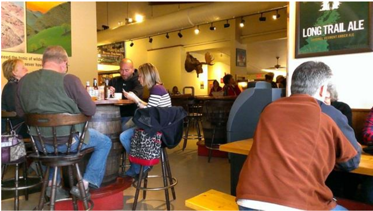
Figure 5 Is the rest of the Moose on the other side?