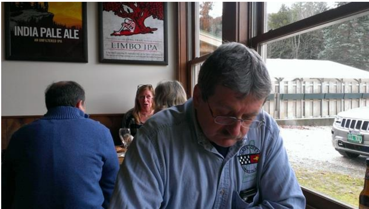
Figure 6 Contemplating Lunch Choices

All being satisfied, we headed east on Rt. 4 heading to Quechee and the Simon Pearce Glass factory. In the “factory” there are several large areas of product displays, a restaurant, and in the lower level there are glass blowing demonstrations. What surprised me was upon exiting the store, no one in our group had a shopping bag in hand (no purchases!).