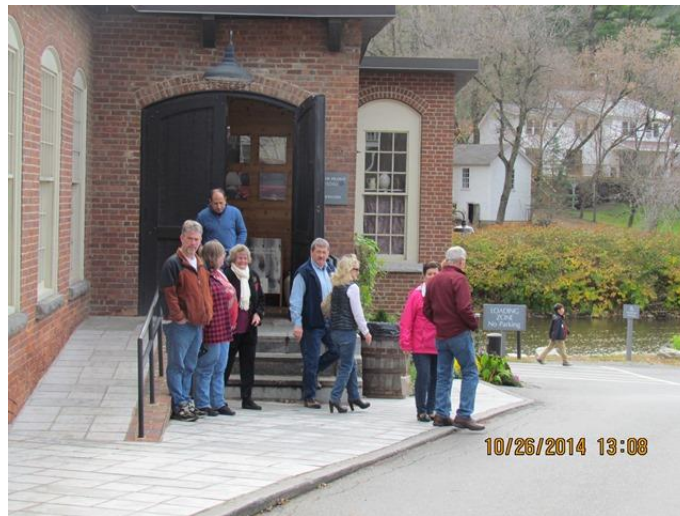
Figure 9 What A Surprise - NO Bags!

We then headed to the Quechee Gorge Village Shoppes where there is a Vermont Spirits store, Vermont Woodworking store, Cabot Cheese store, antiques plus, and the Quechee Diner and Restaurant. We started with the Vermont Spirits store, and then headed to the Cabot Cheese store which included a small general store. I think we all sampled most of the Cabot cheeses that were available. While in the store we saw an odd “Vermont Cow” whose face looked oddly familiar. Upon exiting the stores, some had shopping bags with purchases.