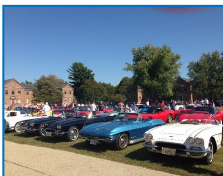
View from the lunch line