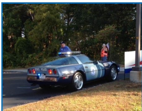
State Police Corvette escort