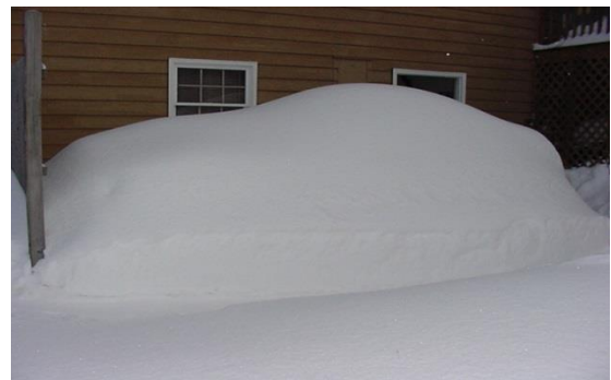
Waiting for spring