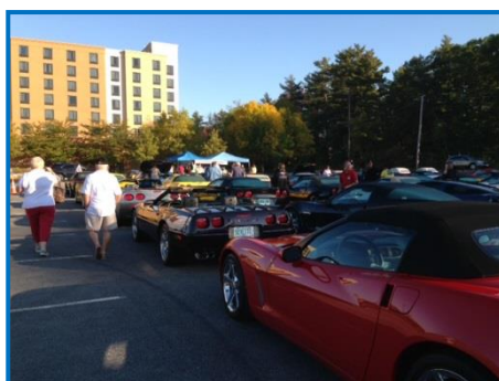
Staged and ready to go