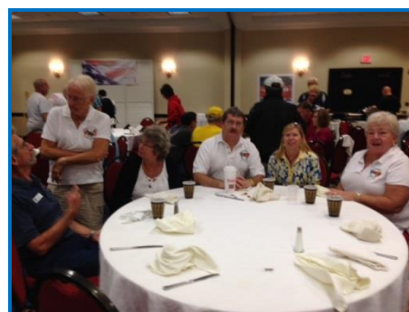
Socializing at breakfast