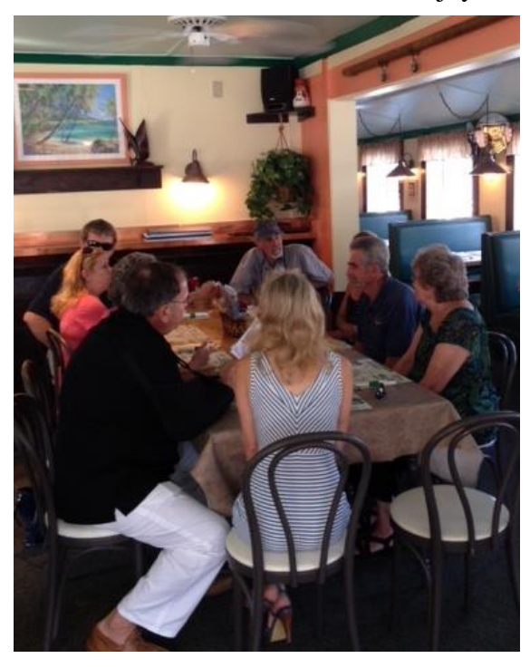
Anchorage Restaurant at Sunapee Harbor

Cocktail hour had started as the MV Kearsage started her 2 hour slow cruise around Lake Sunapee. Each table was selected and guided to the dinner buffet as the Captain talked about the lake and the residences along the waterfront. Everyone enjoyed an assortment of salads, warm foods, and beverages as we cruised along the shorelines. Some ventured out to the walkways on the outer section of the ship to enjoy the views.