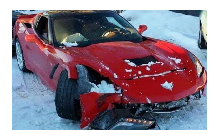
http://www.gtspirit.com/2013/12/31/red-c7-corvette-stingray-crashes-in-the-snow/ Photo credit: GTSpirit

Not a lot of details for this month's poor Vette. This red Z51 C7 looks like it didn't enjoy its drive in the snowy conditions in Milwaukee, WI. With the amount of snow rammed up into the engine bay and the front wheel well, it looks like it went nose first into a wall of the stuff – causing the air bags to deploy.