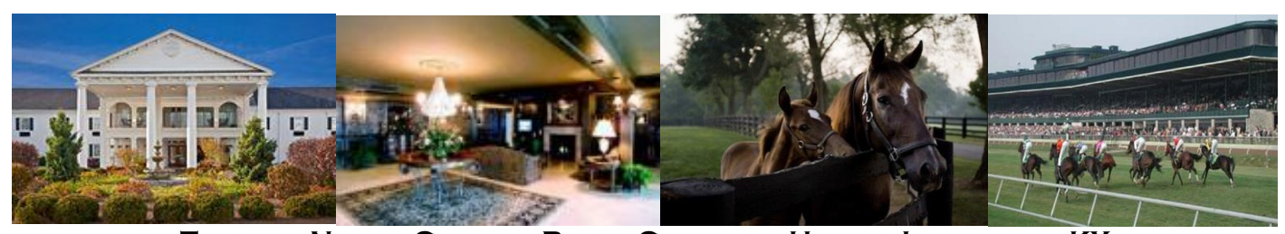
TUESDAY NIGHT - CROWNE PLAZA CAMPBELL HOUSE - LEXINGTON, KY