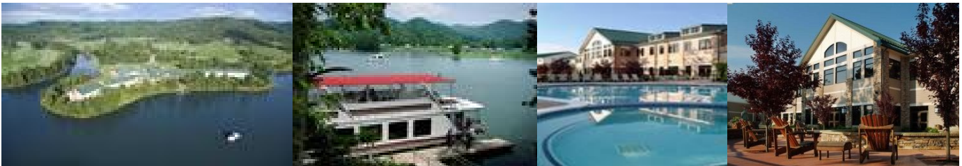
Monday Night - Stonewall I Resort - Roanoke, West Virginia