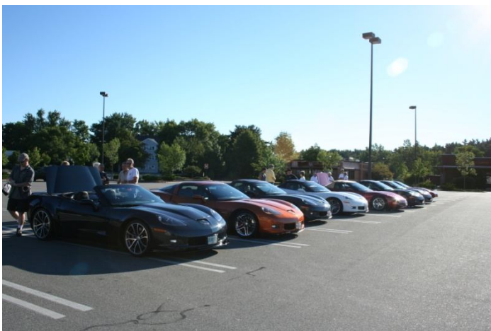
Gathering at the Kohl's Parking Lot

When I first walked up on the yellow Camaro on the left, I thought it was a total PoS. Stepping around to the front and reading the board – it was actually an accurate reproduction of the poor condition Camaro that was the original form of “Bumblebee” from the first Transformers movie. They had accurately reproduced the car, down to the Bondo, aged paint, etc. It was an interesting clone of the movie car.