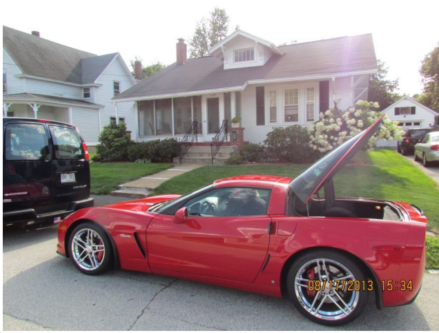
Arrival for cocktails and snacks