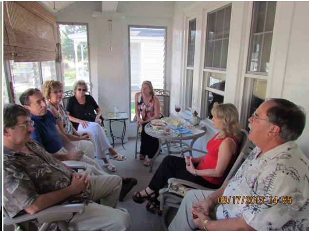
Who wants the last hors d'oeuvre?

Once we consumed most of the appetizers (but not most of the cocktails!), the group headed out for Sunapee Harbor. We took I-93 to Concord then picked up I-89 until we reached Exit 12 for Sunapee. Although we were on the highway, the ride was nice and as always, the scenery was great. Upon entering Sunapee Harbor we headed for Lake Street where we would park and meet the Mt. Kersarge.