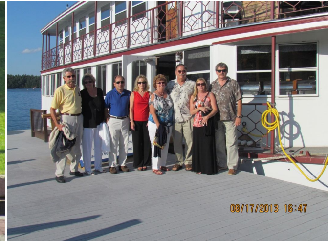
Ready for boarding