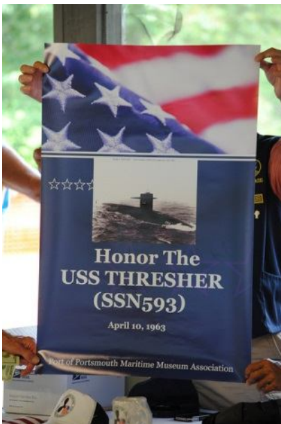
Poster up for auction