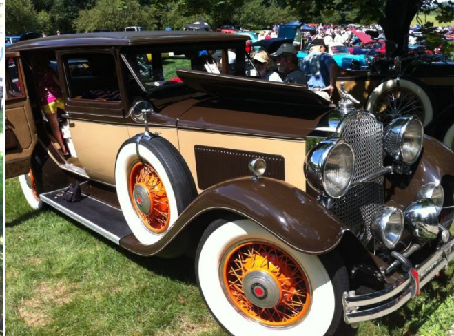
And a Packard coupe