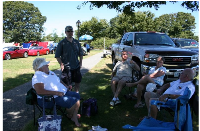
Grabbing a spot in the shade