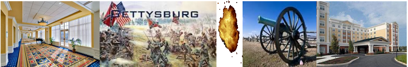
Sunday Night - Wyndham Hotel - Gettysburg, PA

Kick off – Saturday August 23, 2014 - Danbury, CT New Engl and Corvette Caravan departs Sunday A.M. from Danbury