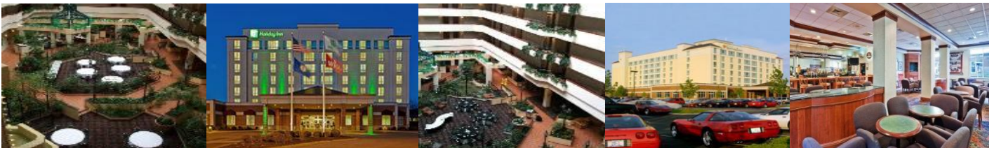
Wednesday, Thursday, Friday, Saturday - Holiday Inn University Plaza - BG, KY

To find out more go to our website: http://www.nationalcorvettecaravan.com/newengland/ On Facebook New England Caravan 2014