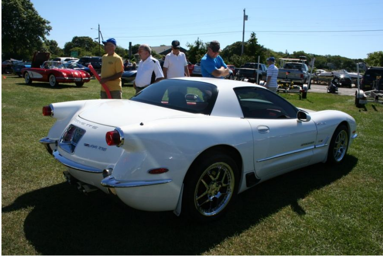
Custom "Z06 Z16" – Turbocharged with '53 Styling