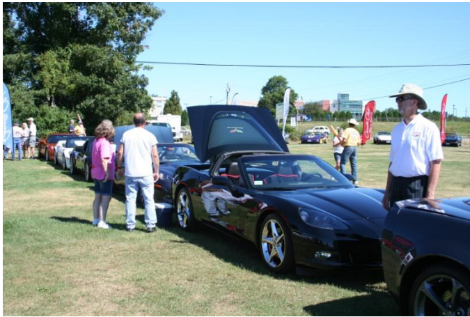
Arriving and Cleaning