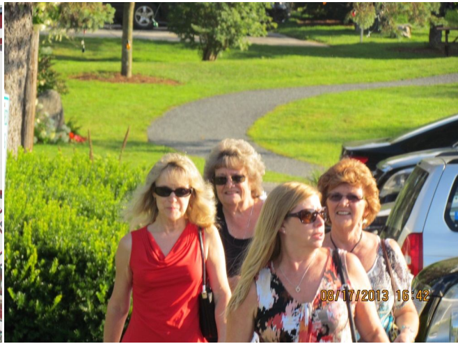
Ladies returning from a pit stop