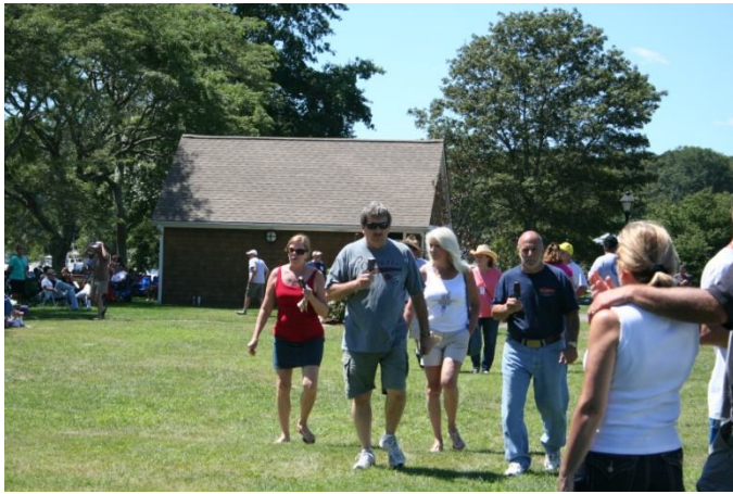
We have found ICE CREAM