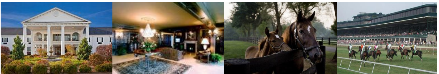
Tuesday Night - Crowne Plaza Campbell House - Lexington, KY