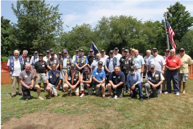
Thresher base members

After the business meeting everyone enjoyed their lobster or steak and a good time was enjoyed by all. As many organizations do, there were items that went up for auction (I won the bid for the USS Thresher poster), and 50/50 tickets were sold. There was also a raffle for a 20 lb. lobster (cooked).