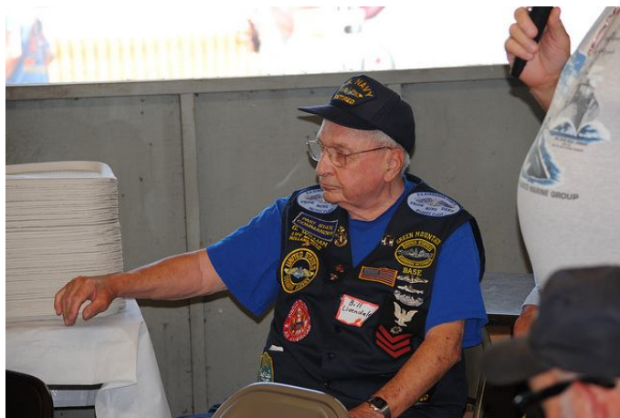
World War II sub vet