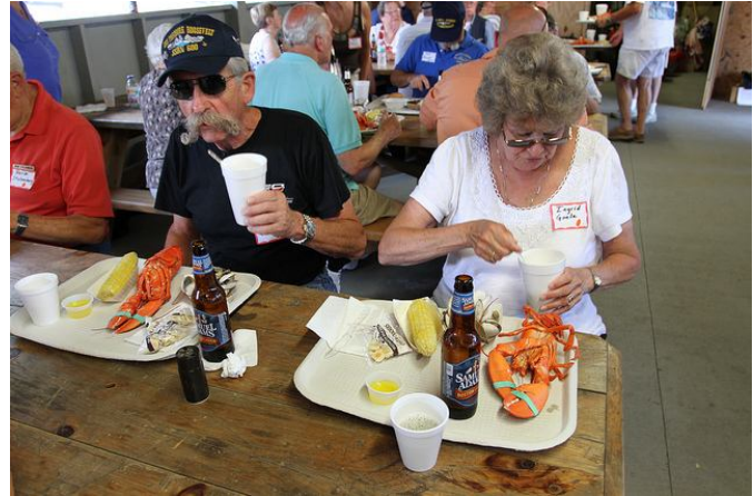
Now it's time to eat!