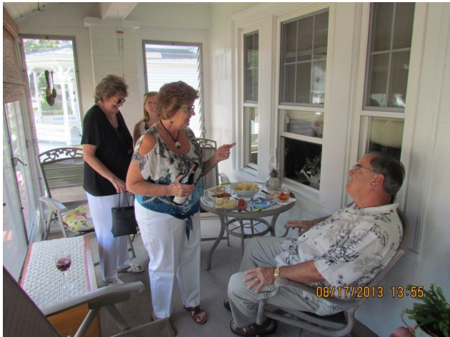
Last minute instructions