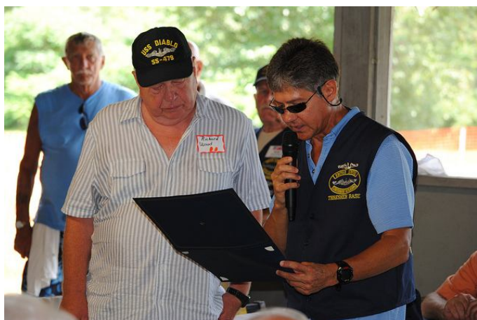
Holland Club induction