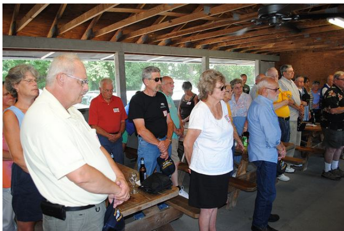
Meeting getting underway.

The Thresher Base picnic is held at the American Legion facilities in Seabrook, NH. The Legion members take care of the cooking – lobster or steak, steamers, corn, and salads – and they do a great job. The start of the day began with a Base business meeting, installing members into the Holland Club for those who during the year celebrated 50 years since qualifying on their first submarine (I will make that milestone next year), announcing the Submarines that have been lost for the months of July and August, then taking group pictures – of all the Base members then the Holland Club members.