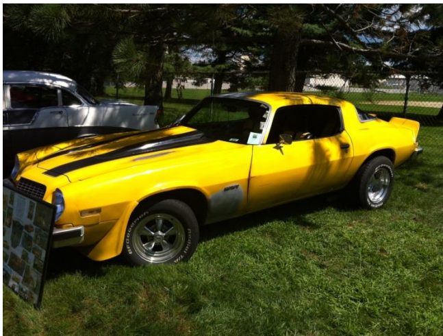
A duplicate of Bumblebee from Transformers

I find myself drawn to the old late 20's – early 30's cars lately... I can easily see something like this as one of my next 'fun' cars, next to the Vette in the garage. I really loved these two Packards – they were in great shape, and just really pretty to look at.