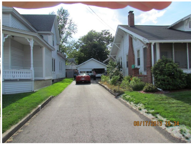
Room for several more visitors