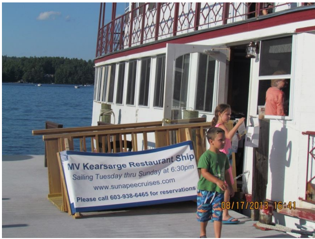
This is the place