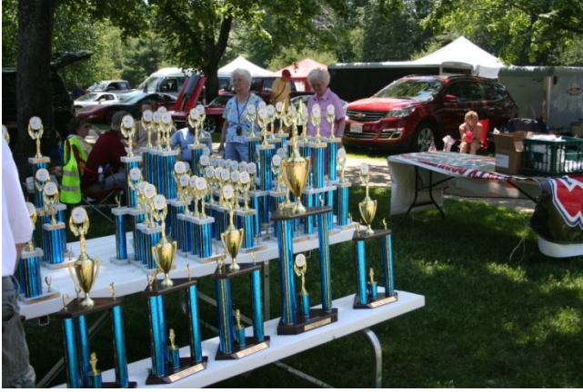
Many trophies waiting to be awarded