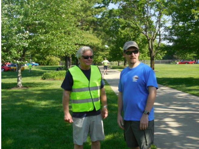
Parking staff await the next car

From Spring Fling 2013 by Roger Collins: