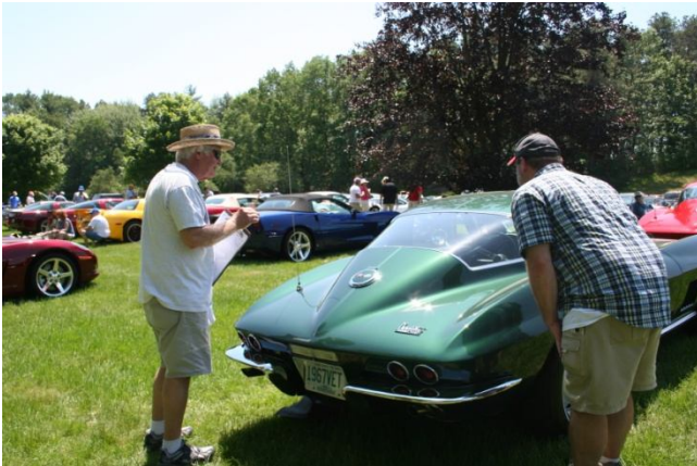
A smudge? No wait, that's my reflection...