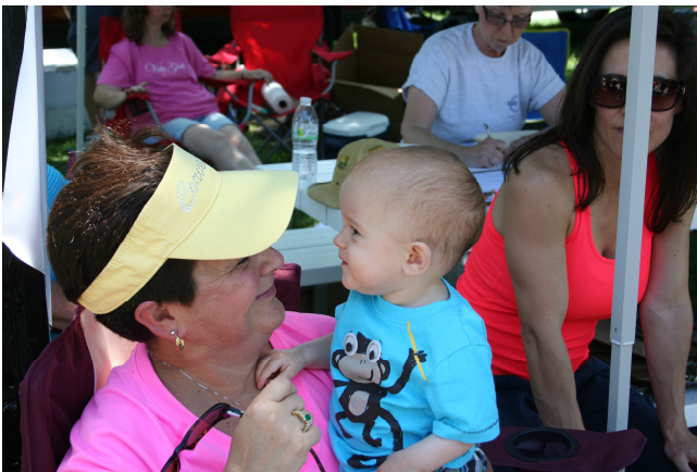
Never too early to hook the next generation