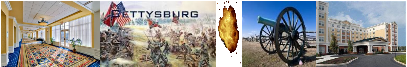
Sunday Night - Wyndham Hotel - Gettysburg, PA

Kick off – Saturday August 23, 2014 - Danbury, CT New Engl and Corvette Caravan departs Sunday A.M. from Danbury