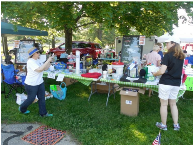
Amazing raffle table items this year