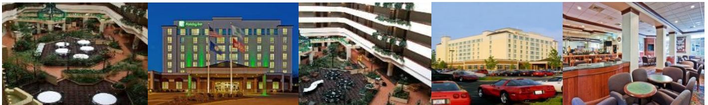
Wednesday, Thursday, Friday, Saturday - Holiday Inn University Plaza - BG, KY

To find out more go to our website: http://www.nationalcorvettecaravan.com/newengland/ On Facebook New England Caravan 2014