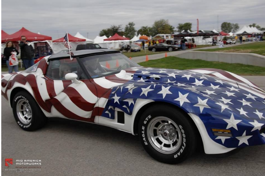
Now that's one patriotic C3