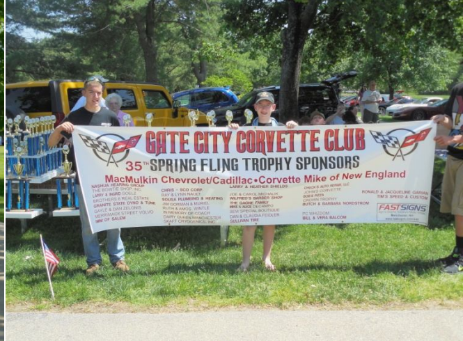
35 Years of Spring Fling!