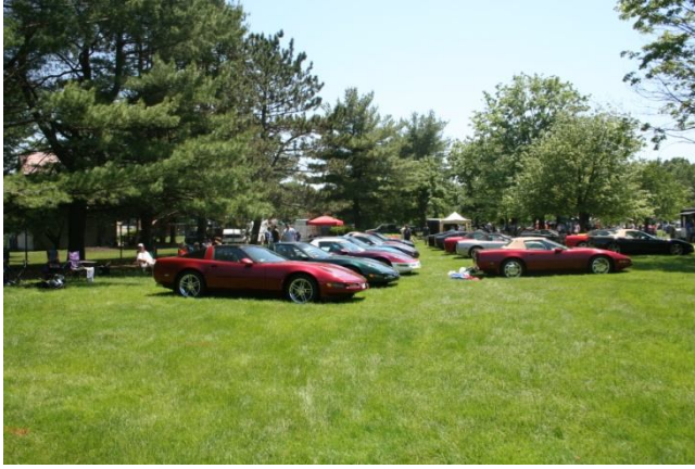
The cars gathering in the grass