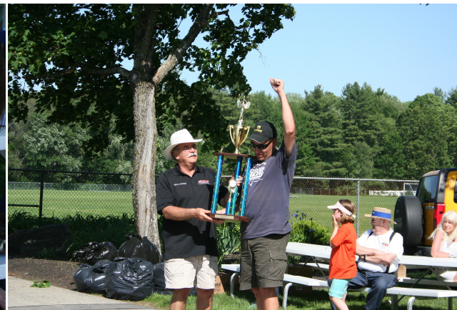
Best in show – what a feeling!