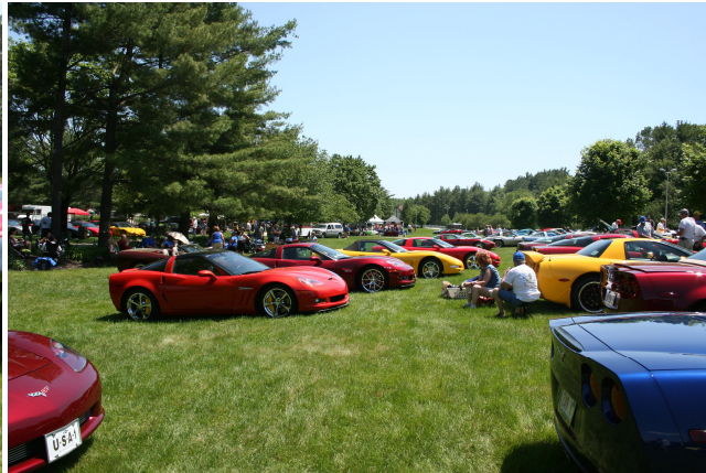
Waiting for judging