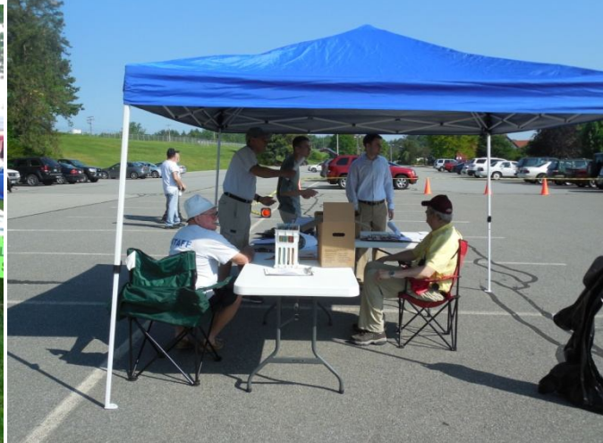
Check-in and car classification station