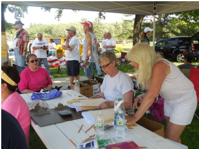
Getting the judging sheets together