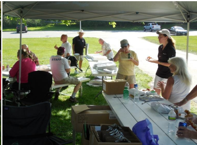
Post-event pizza party time!