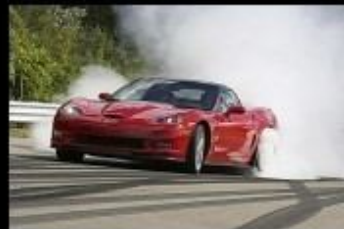
What society thinks I do.