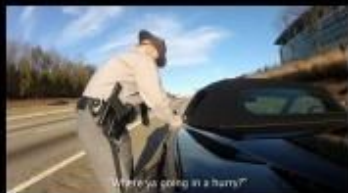
What Insurance Companies think I do