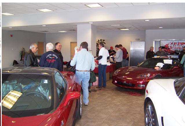
Shop, clean, and chat the day away!