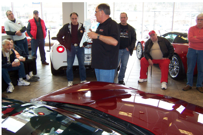
Pay attention and you'll see how easy it is!