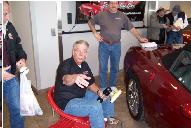
So easy, even YOU can do it!