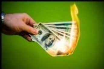
What my family thinks I do.