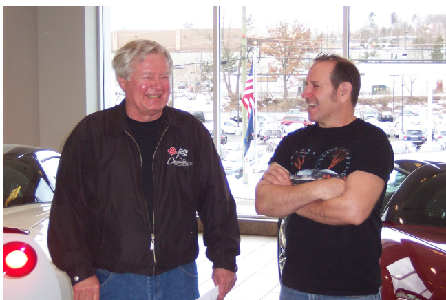
Who knew detailing was so much fun?