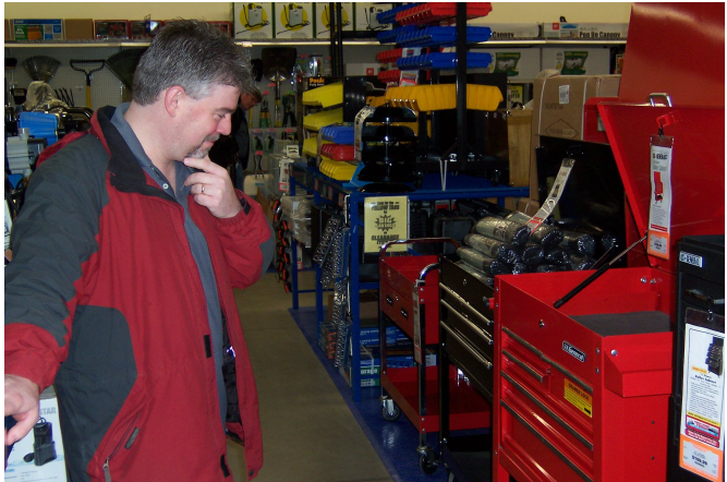
Still thinking about it...