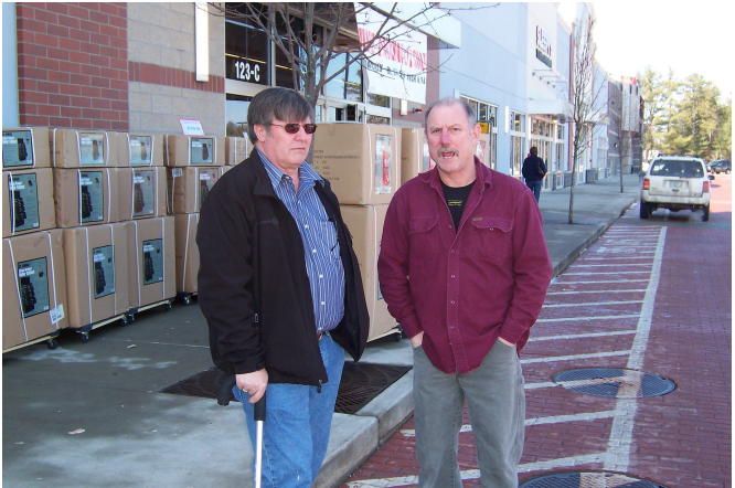
(They didn't actually buy all those boxes...)