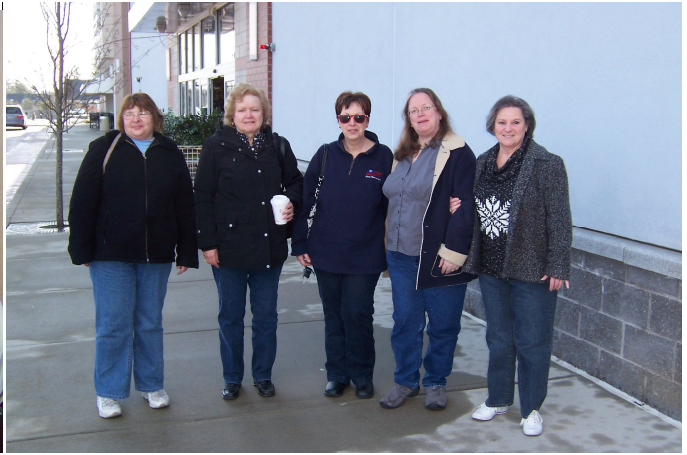
The ladies about to go do their part for the economy!