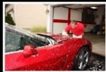
What I actually do.