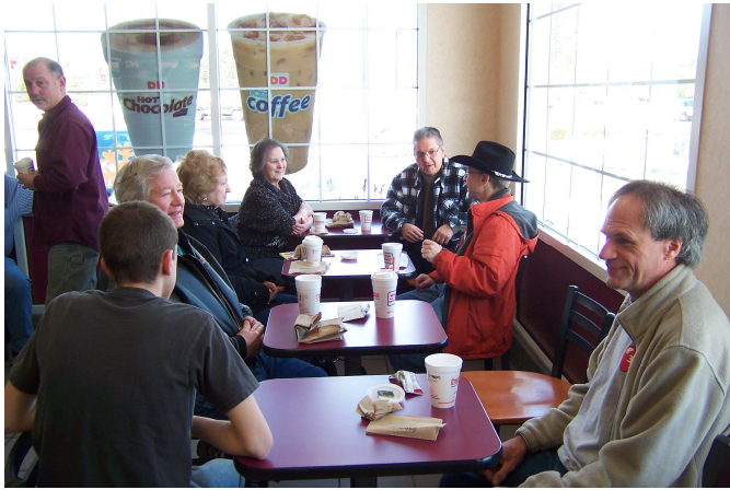
Before we shop... COFFEE.