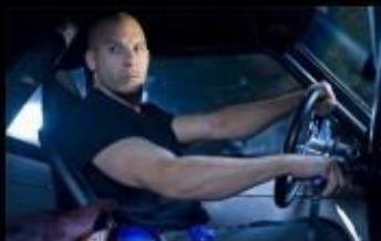
What I think I do.