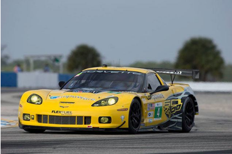
#4 on its way to a win at 12 hours of Sebring ALMS (GT Class)