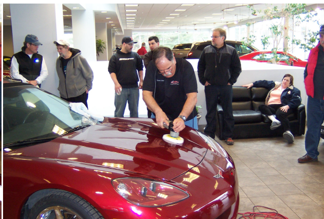
Letting the Porter-Cable do all the work.