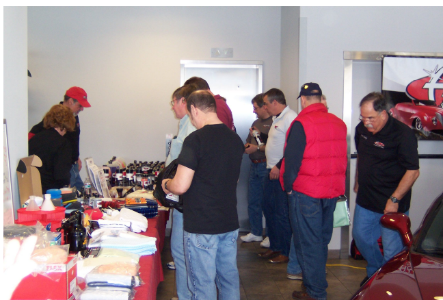
Plenty of product for everyone!