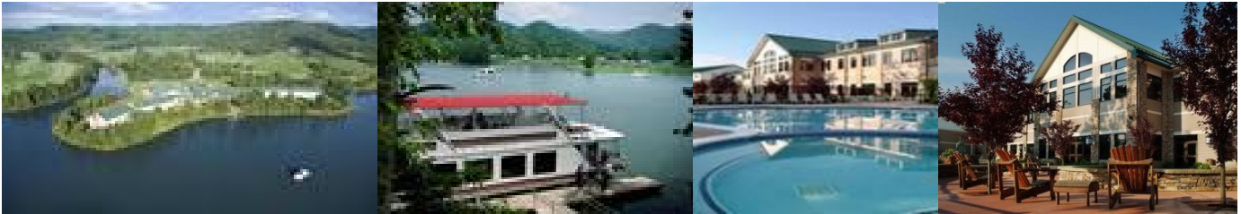
Monday Night - Stonewall I Resort - Roanoke, West Virginia