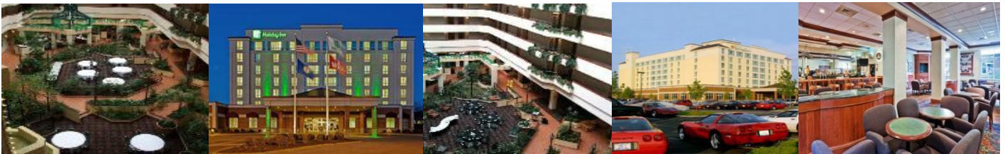
Wednesday, Thursday, Friday, Saturday - Holiday Inn University Plaza - BG, KY

To find out more go to our website: http://www.nationalcorvettecaravan.com/newengland/ On Facebook New England Caravan 2014