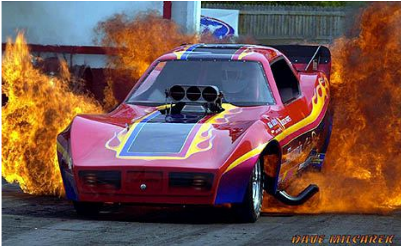
An impressive Corvette "burn out"