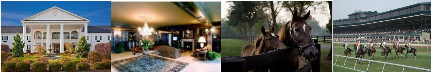
Tuesday Night - Crowne Plaza Campbell House - Lexington, KY