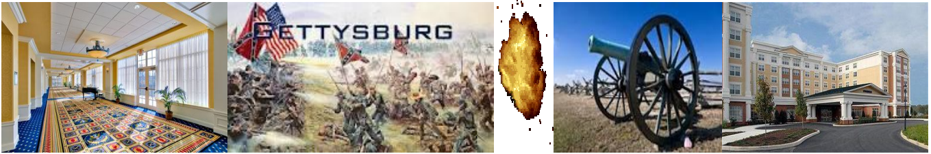
Sunday Night - Wyndham Hotel - Gettysburg, PA

Kick off – Saturday August 23, 2014 - Danbury, CT New Engl and Corvette Caravan departs Sunday A.M. from Danbury