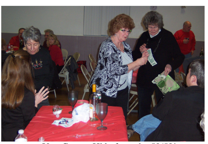
You Cannot Hide from the 50/50!