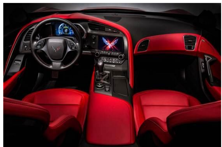
Interior – Addition of Digital Screen to Gauges

The new gauge cluster will be interesting, as it looks to have an analog speed on the left, and a few other gauges like oil temp & such on the right, but the prominent center part of the gauge cluster is a digital screen. It will have about 3 configurable modes (similar to the HUD options on the C6, e.g., sport/track mode) that will feature different information prominently.