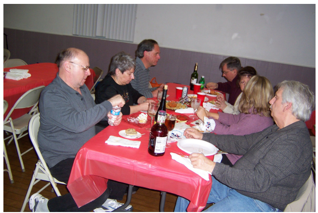
Plates Getting Cleared, Desserts Eaten