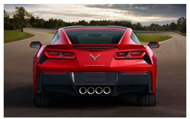
The love it or hate it rear-end