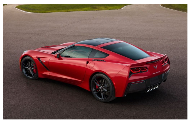
Look forward to seeing in person!