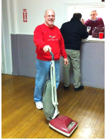
Al helped Vacuum!