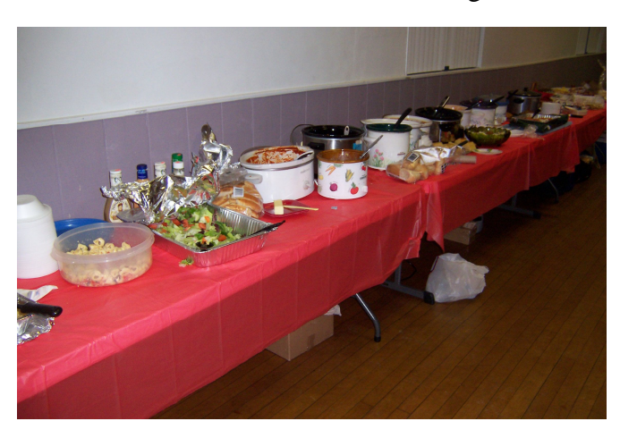
Always More Food than we can Eat