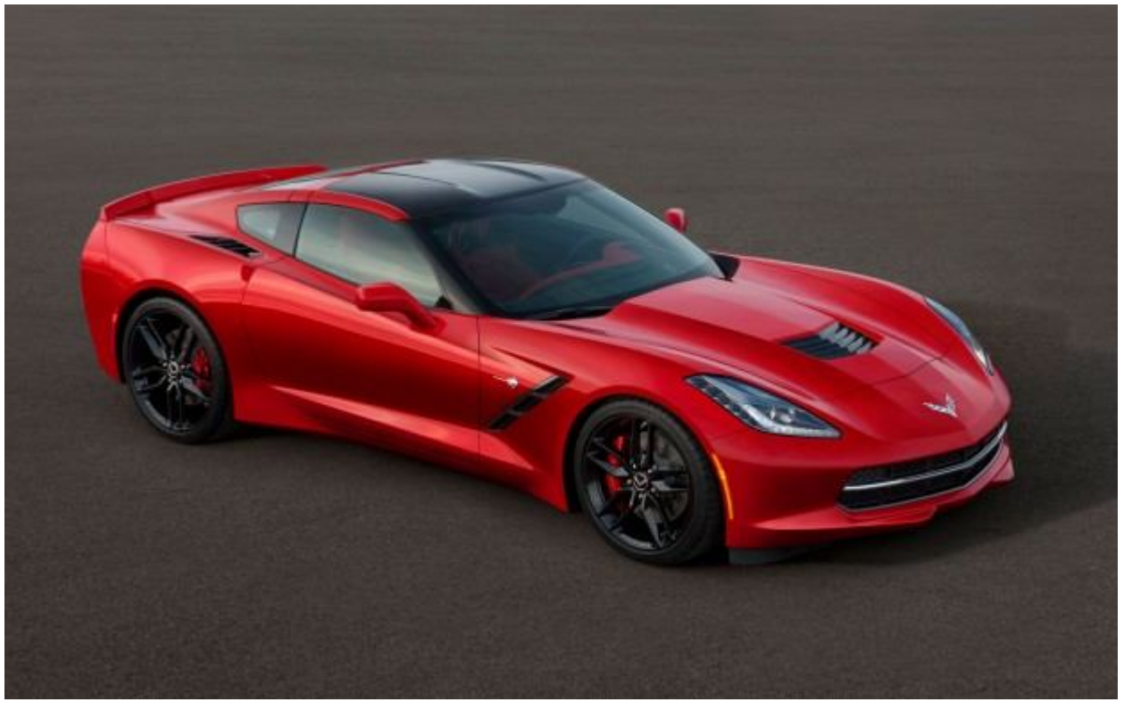
The First 2014 C7 Corvette

On Sunday, January 13<sup>th</sup>, Chevrolet revealed to the world the new look of the Corvette for the coming generation. With many of us gathered at Blake's Ice Cream, and at least one of us actively keeping track of the Pats score via smart phone... the time came for the reveal. I saw at least 3 phones & one iPad out for watching the streaming presentation on the web to get our first glance at what the C7 would be. While an evolution of the C6 design, there will be no confusing of the two. Notably, they have also brought back the "Stingray" name – there is no 'base model', just Stingrays at this point.