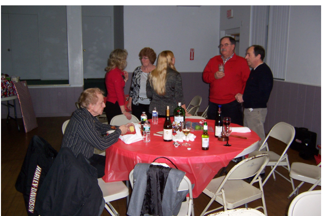
Good Conversation and a Little Wine