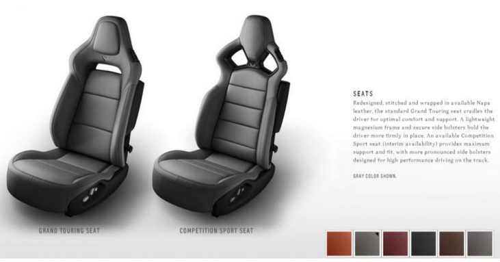
View of the Two Seat Styles

Additional information is slowly leaking out. We know there are two seat options available, a grand touring normal seat & an upgraded competition sports seat. The interiors have 5 color options: Brownstone (LT3 only), gray, adrenaline red, jet black, Kalahari (LT2/LT3 only). The C7 will also herald the return of a green external color (can we get Mike back into a Vette?). Color options will be black, Laguna Blue tintcoat, Crystal Red tintcoat, Cyber Gray metallic, Lime Rock green, Night Race Blue metallic, Torch Red, Blade Silver metallic, Arctic White, and Velocity Yellow tintcoat.