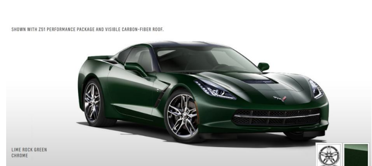
The C7 Site Lets You Preview the Colors

Additional information is slowly leaking out. We know there are two seat options available, a grand touring normal seat & an upgraded competition sports seat. The interiors have 5 color options: Brownstone (LT3 only), gray, adrenaline red, jet black, Kalahari (LT2/LT3 only). The C7 will also herald the return of a green external color (can we get Mike back into a Vette?). Color options will be black, Laguna Blue tintcoat, Crystal Red tintcoat, Cyber Gray metallic, Lime Rock green, Night Race Blue metallic, Torch Red, Blade Silver metallic, Arctic White, and Velocity Yellow tintcoat.