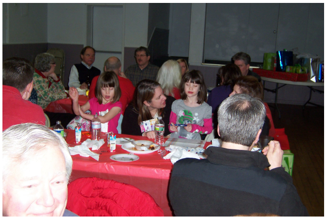
The Girl Scout Cookie Sales in Progress