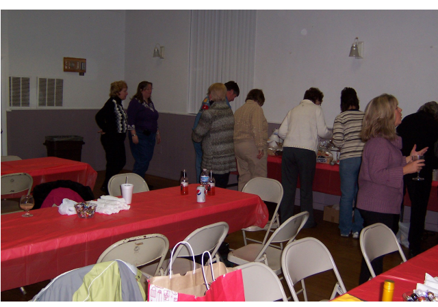
Everyone Lines Up for Chow