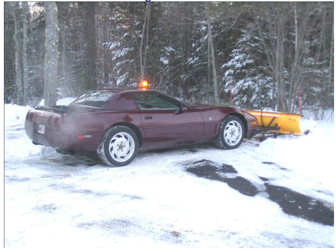
When you have a C4 and the snow just isn't going to move itself!