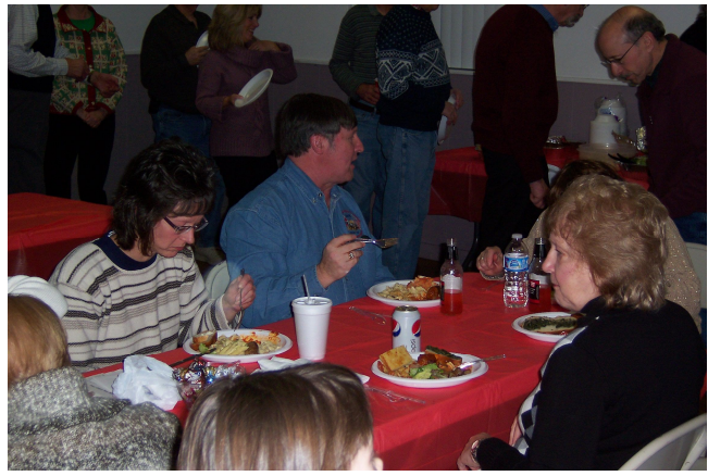
Usually Gets Quieter Once Food is Served