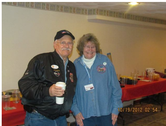
North Shore is Here

Friday morning we completed the setting up, then some of us headed into Ogunquit for lunch at Jackie's Too (not recommended). Friday's Meet and Greet activity started in the late afternoon where folks could purchase Penny Table raffle tickets, tickets for NCM car raffle, and Caravan clothing (consisting of shirts, jackets, caps, etc.) along with Caravan decals. The design for the NE Caravan turned out quite nice and stands out on the shirts and jackets. At 6 PM forty-three boxes of pizza arrived and dinner was served. The left over pizzas were taken by folks for consumption later. After the pizza party, everyone collected around the indoor pool where Randy made a presentation on the Caravan plans, the daily happenings along the Caravan route and what the NCM plans are once we arrive in Bowling Green. Next the Penny Table item winners were drawn and a mounted collection of NCM memorabilia (donated by Karen Blandini) was auctioned off. Afterwards some GCCC folks gathered in the Whittier Suite for beer, hors d'oeuvre's and just hanging around.