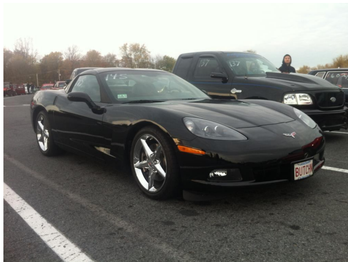
Number on, time to wait

I know the brochure states 12.6 @ 115 & I was hoping for with street tires to attain a high 12 second pass & back it up with another or two passes. I drove 368 miles, set cruise for 70 MPH & arrived in just about 6 hours attaining a little over 28 MPG on my 2200 mile, 2 month old car. At the track I put the M6 in Competitive mode, did a quick burn out to clean off the stock F1's, which I left at regular air pressure & staged.