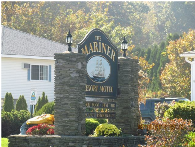
The Mariner Resort Motel