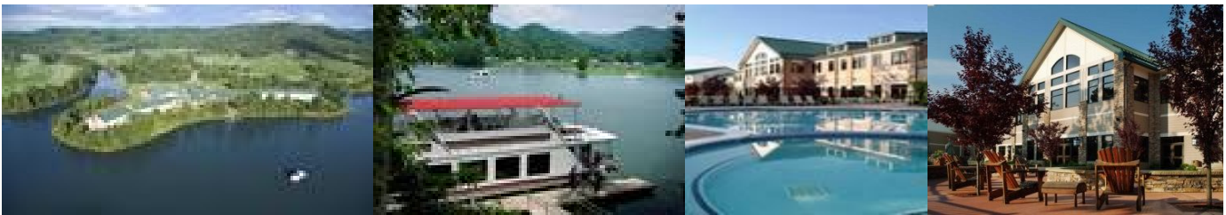
Monday Night - Stonewall I Resort - Roanoke, West Virginia