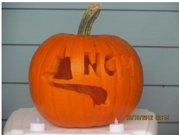
Creative Pumpkin Carving