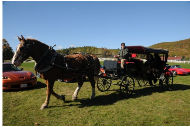
... and by carriage to see our cars.