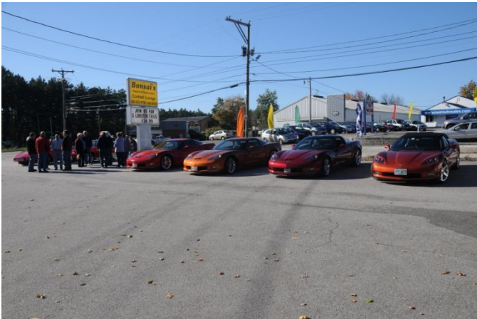
Gathering at Bonsai's Parking Lot

Here are a few more pictures from our trip last month to Castle in the Clouds: