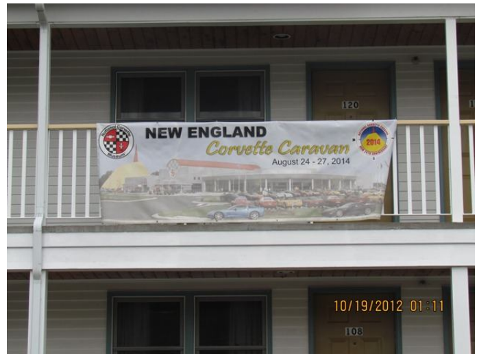
The Caravan Banner