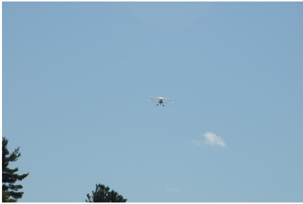
They came by plane...