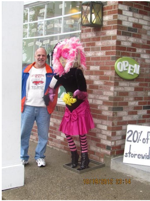
Al Finding Companionship