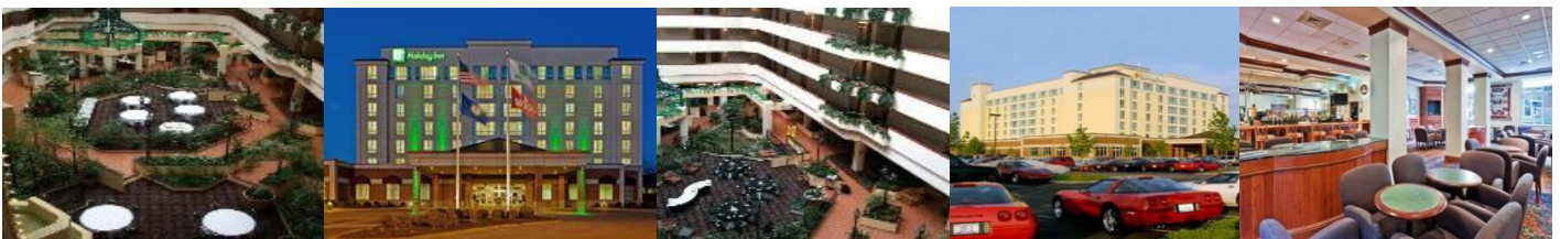
Wednesday, Thursday, Friday, Saturday - Holiday Inn University Plaza - BG, KY

To find out more go to our website: http://www.nationalcorvettecaravan.com/newengland/ On Facebook New England Caravan 2014