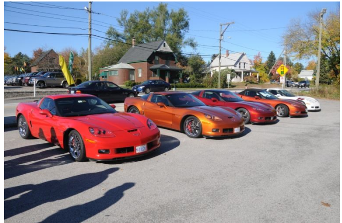
Lined up and Waiting