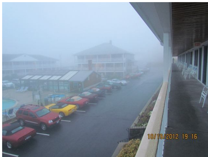
It isn't always Sunny in Ogunquit

Sunday we packed up and headed south stopping along the way for breakfast. After breakfast we all headed for home. Everyone had a very good time and most are looking forward to attending the next NE 2014 Caravan Meet and Greet to be held on 28 – 30 June in Stowe, VT. Registration for this next Meet and Greet is now open with the registration form available on the NE Caravan web site ( www.nationalcorvettecaravan.com/newengland ).