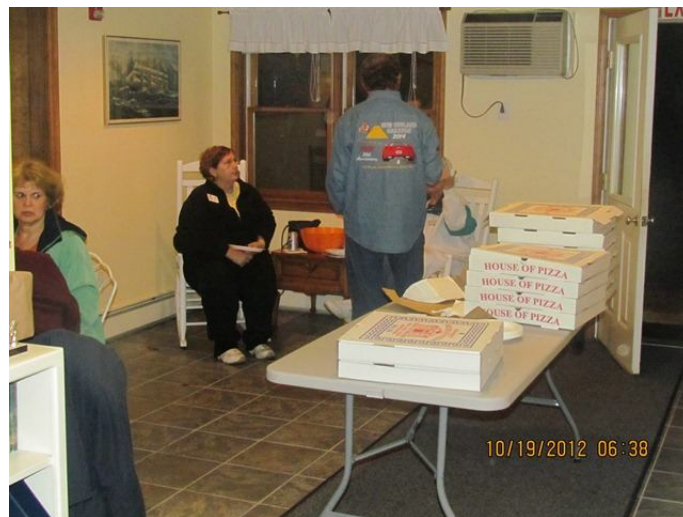
Here comes the Pizza!

Saturday morning we had breakfast (continental) at the motel then headed into Ogunquit to window shop. Al and Joe were seen hanging around a "local beauty". After doing all the shops, we headed up Rt. 1 to find restaurant for lunch. With nothing in sight that met our high standards, we decided to go to Billy's Chowder House. It was agreed that given it was around 2 PM, we would have a light dinner of the leftover pizza for dinner. All enjoyed Billy's.