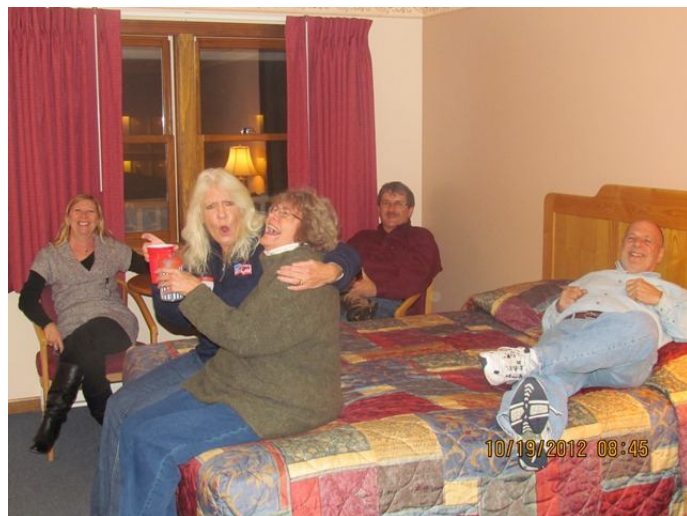
My, isn't this Cozy?