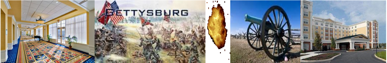
Sunday Night - Wyndham Hotel - Gettysburg, PA

Kick off – Saturday August 23, 2014 - Danbury, CT New Engl and Corvette Caravan departs Sunday A.M. from Danbury