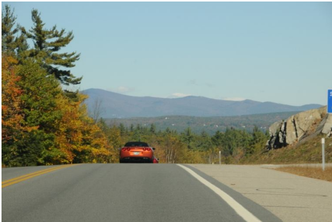
What a view! Nice mountains too...