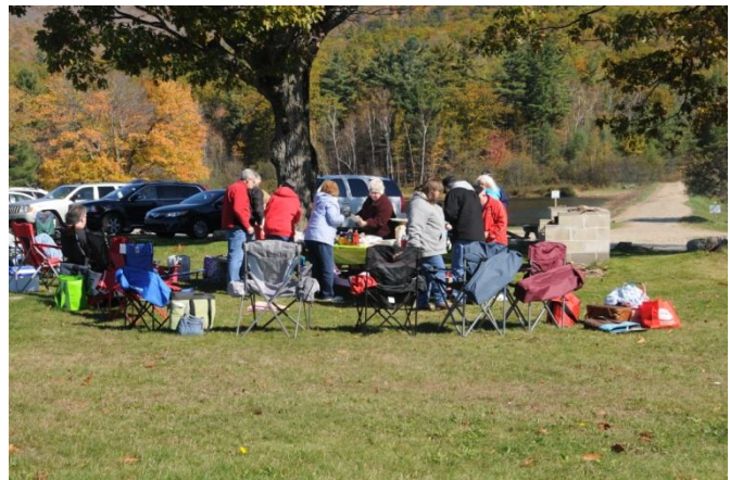
The organized chaos of food preparation