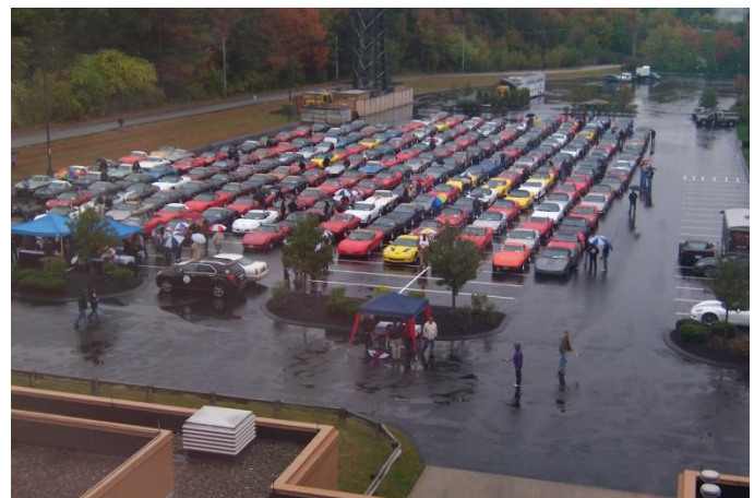
The Cars Gather in the Wet