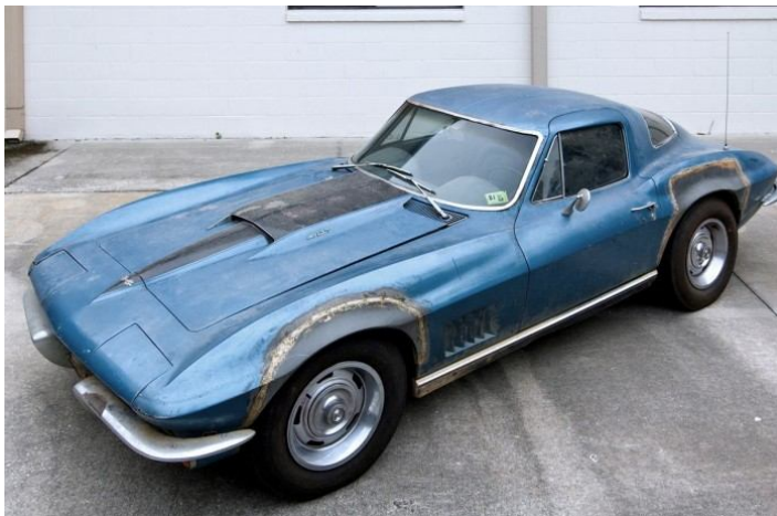
Survivor: Neil Armstrong's 1967 Corvette

http://blog.hemmings.com/index.php/2012/10/03/neil-armstrong-corvette-heads-toward-preservation/