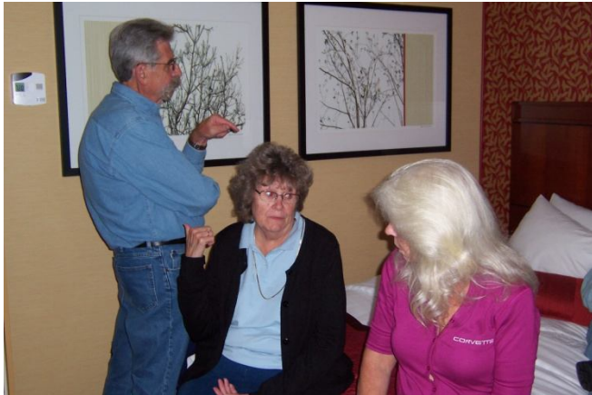
"He did it" – "She did it"