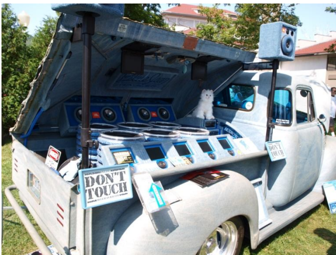
But is it Loud?