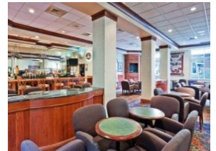
Wednesday, Thursday, Friday, Saturday - Holiday Inn University Plaza - BG, KY