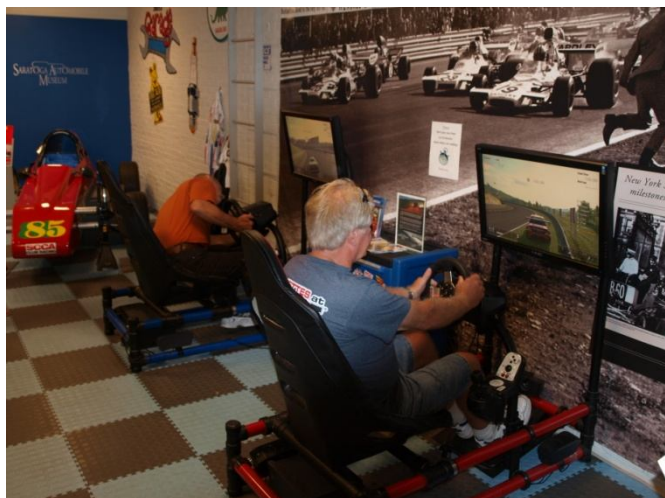
AI vs. Bill – Who will reign supreme?