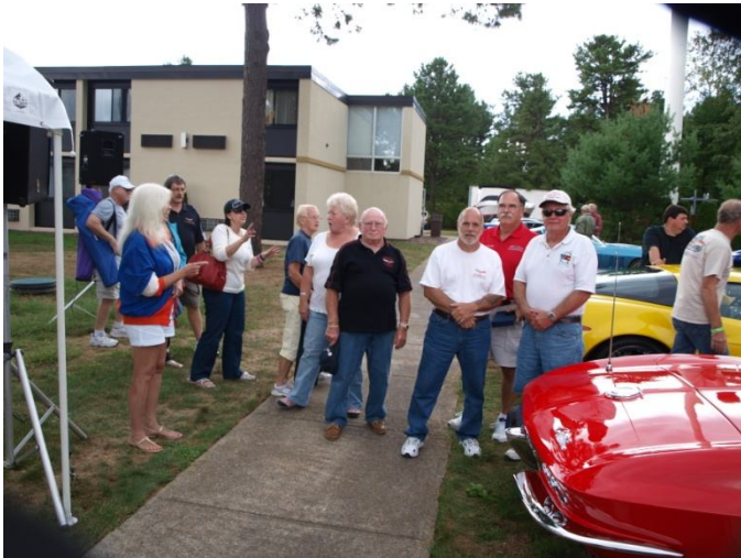
Gate City Members Milling About