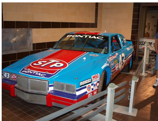
Paging Mr. Petty, your Car is Ready