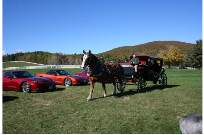
505+ HP. 400 HP. 1 HP.