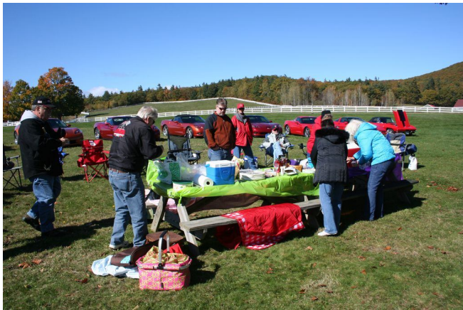
The Meal Assembles