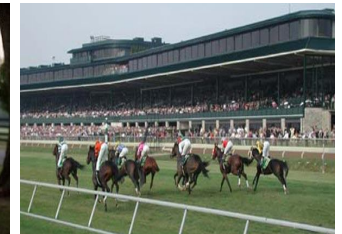
Monday Night - Stonewall I Resort - Roanoke, West Virginia