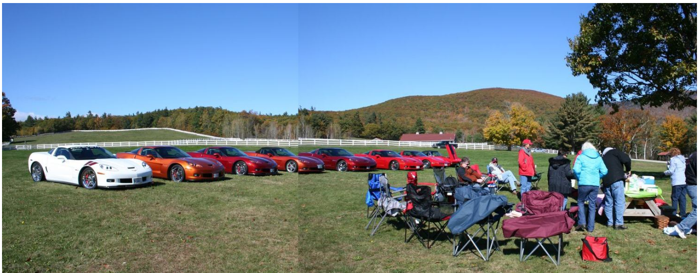
A Hacked Together Panoramic View of the Event!