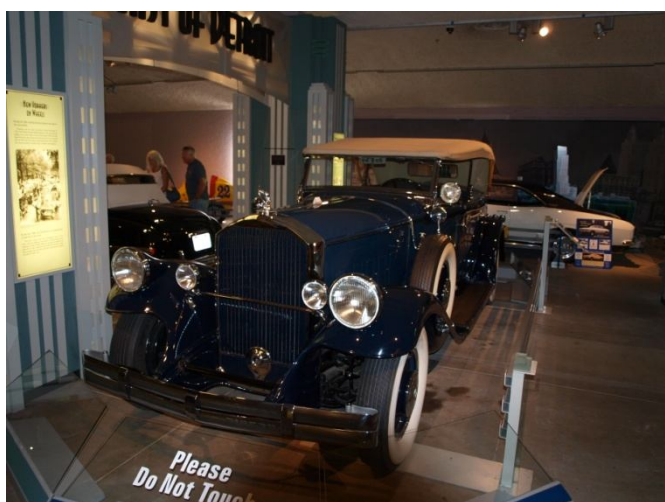
Some sweet antique rides