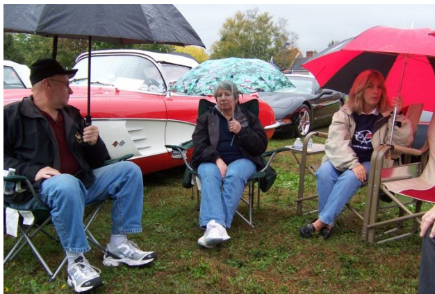
Keeping Spirits & Umbrellas Up

I was thrilled to see that so many cars came out despite the bad weather for such a worthy cause. Let's hope we get a better weather day for next year!