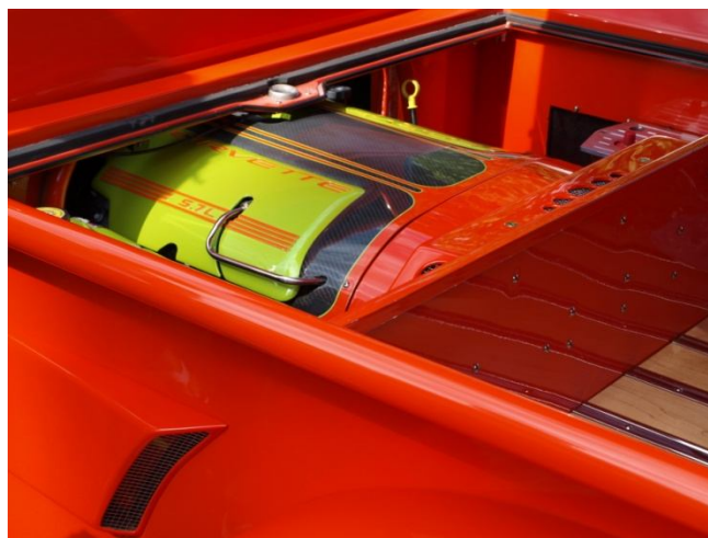
Corvette Engines end up in Strange Places