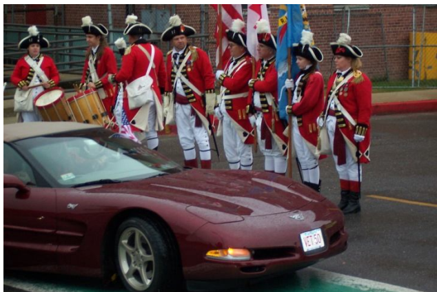
Color Guard Greeting Cars as they Arrive

Everyone headed over to the Veterans home in the parade of cars, including our 16 Gate City cars in attendance. The weather did its best to hold off for us, giving us some periods of dry time. Overall, the event was still a big success. 334 Corvettes braved the elements to support our veterans. Also of note, the veterans choice for the best in show went to a yellow C5! The newest model Vette to ever receive the accolade!