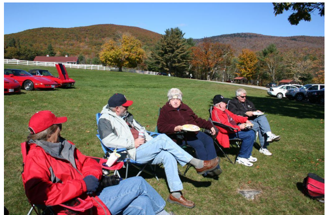
Food & Story Telling – A GCCC Special