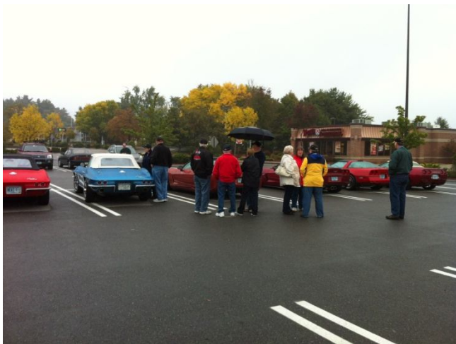
Kohl's Lot – A Damp Gathering

Many of us going down on Sunday morning met in the Kohl's parking lot off of Rt. 3, exit 6. We drove down & joined all of those cars that were already waiting at the hotel, and joined in on the tasty breakfast buffet. With the weather being what it was, people generally gathered inside the hotel until it was time to go get into the cars.