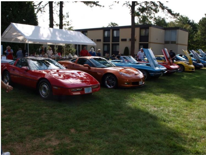
Cars on Display