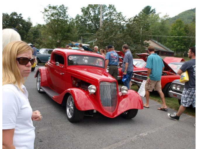
Is anyone else hearing ZZ Top right now?