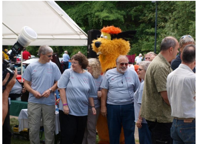
One of these things is not like the others!