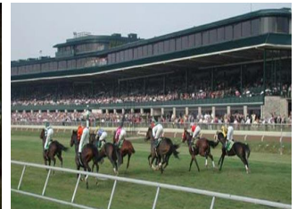
Monday Night - Stonewall I Resort - Roanoke, West Virginia