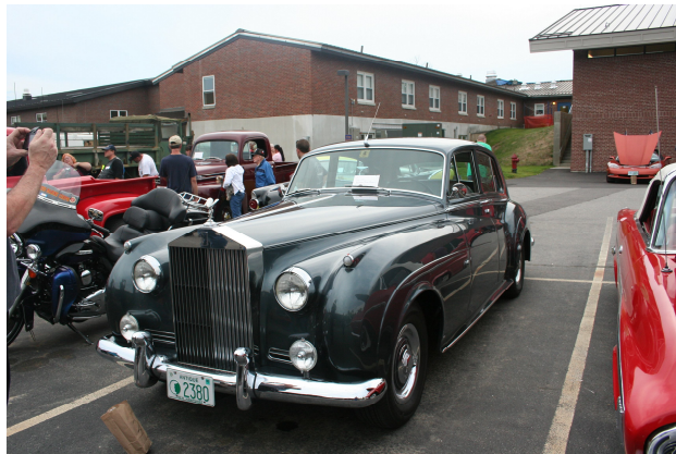
The Rolls won Best of Show