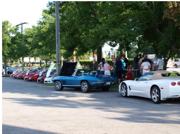
Chatting & Snacking Commence