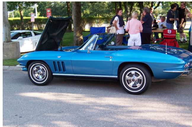
We had C2s