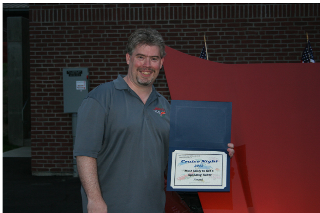
This better not be a jinx!