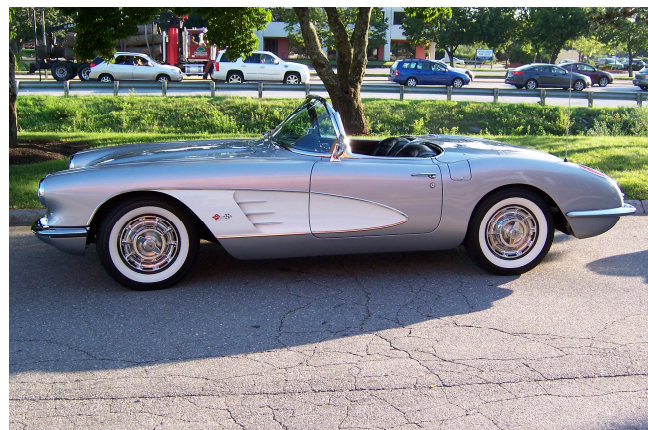
The Manager's Choice Winner!