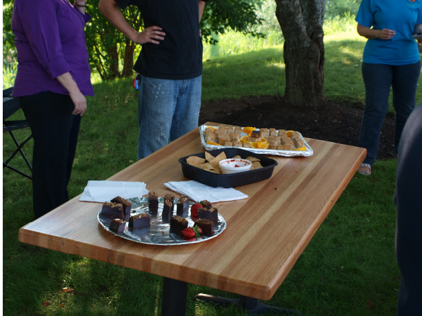
The snack table

The evening began with the kitchen staff of Applebee's making & bringing us fudgy brownie bites, chips & salsa & blonde brownies, as well as soft drinks. Applebee's also provided members with cards for discounts on meals.