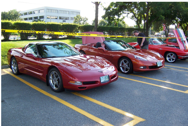
Caution! Vettes Being Cleaned!

Some additional photos from our Applebee's Cruise Night: