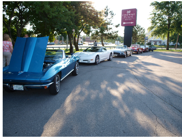
All of the cars lined up in the parking lot