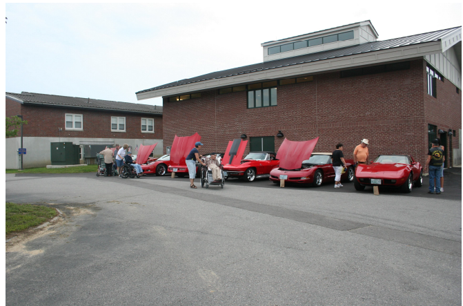
Vette Alley being checked out by the vets