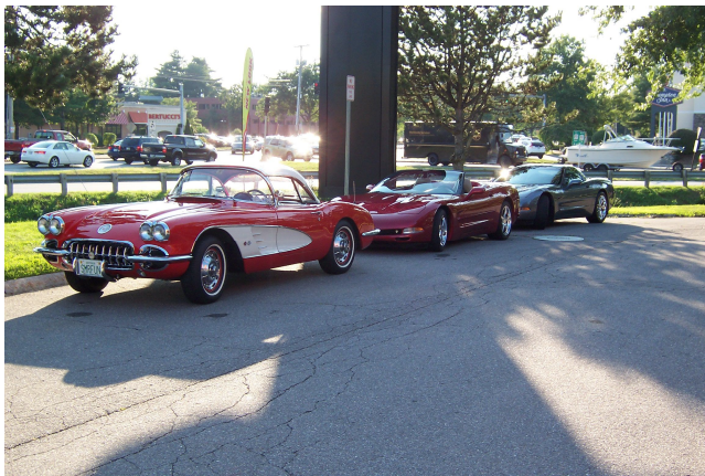
We had C1s and C5s