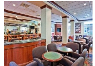
Wednesday, Thursday, Friday, Saturday - Holiday Inn University Plaza - BG, KY