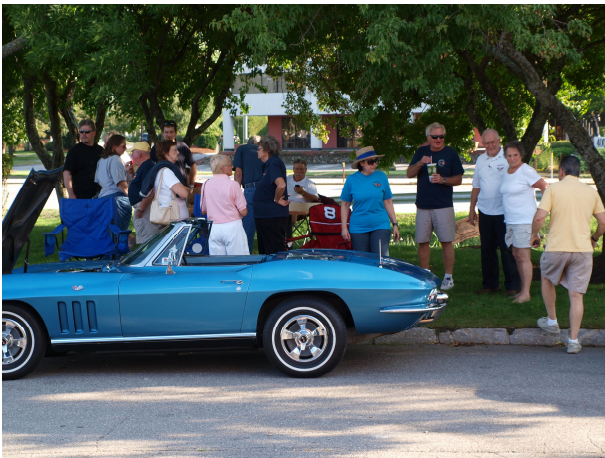
Gathering in the Shady Spot