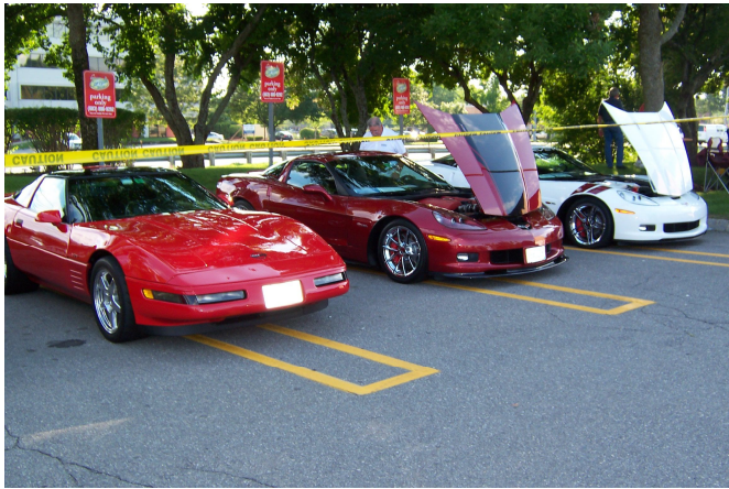
We had C4s and C6s