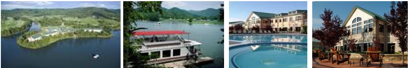
Tuesday Night - Crowne Plaza Campbell House - Lexington, KY