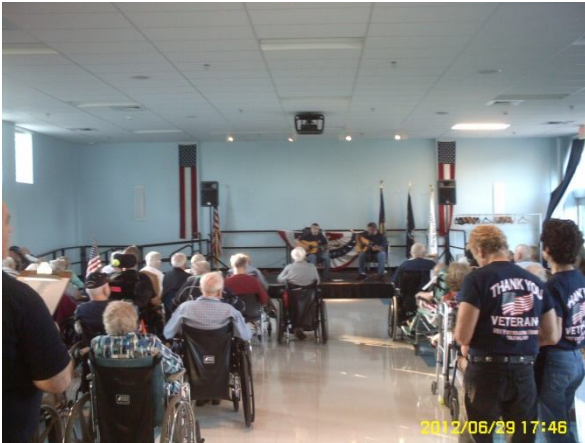
Listening to the Music

It had a slow start at the beginning but we couldn't have ended any stronger. A good time was had by all. The Vets are still talking about it, and the t-shirts were very well received.