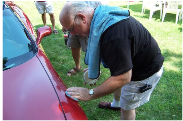
It's not a party 'til someone breaks out the Adam's