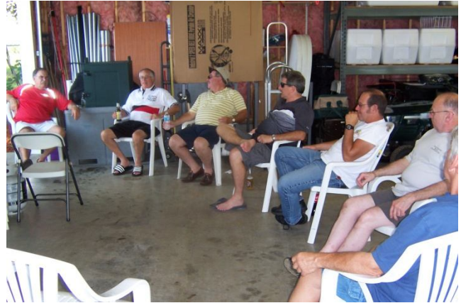
Guys hanging out in the garage