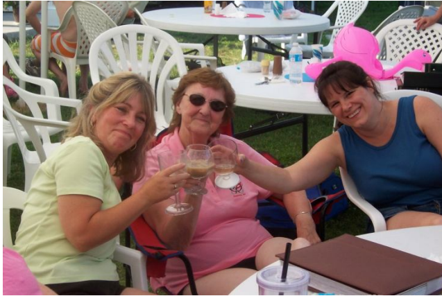
Making friends with mudslides...