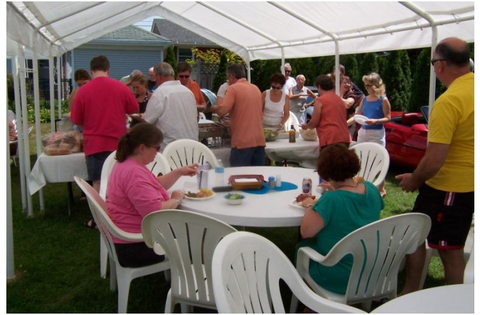
Everyone grabbing a meal