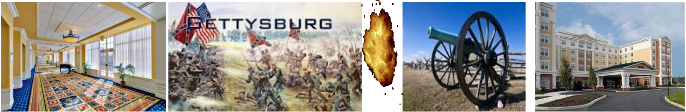
Sunday Night - Wyndham Hotel - Gettysburg, PA

Kick off – Saturday August 23, 2014 - Danbury, CT New Engl and Corvette Caravan departs Sunday A.M. from Danbury