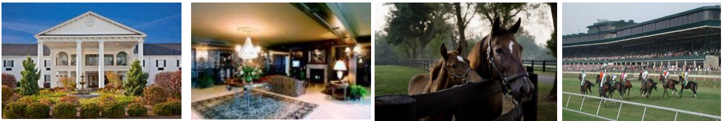
Monday Night - Stonewall I Resort - Roanoke, West Virginia