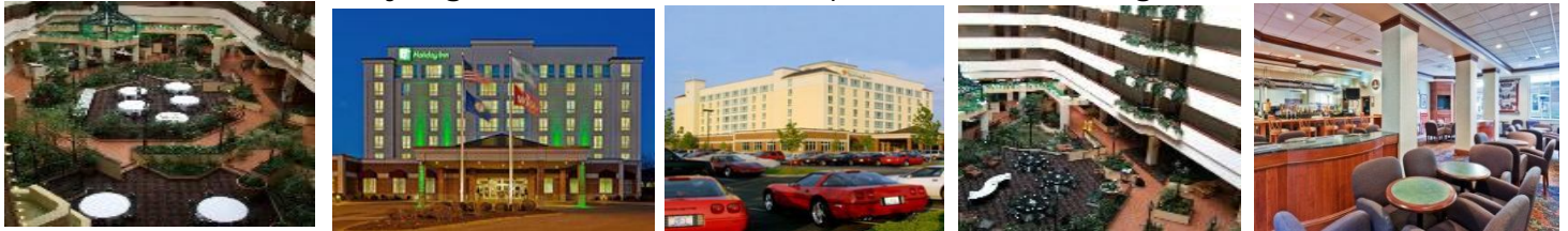
Wednesday, Thursday, Friday, Saturday - Holiday Inn University Plaza - BG, KY