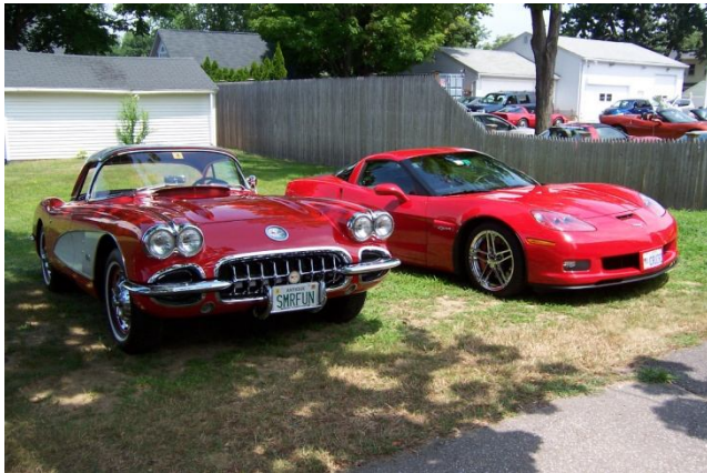
The old and the new – the history of Corvette!