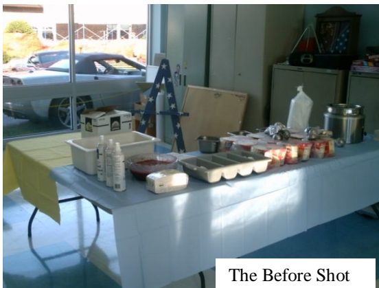
The Before Shot