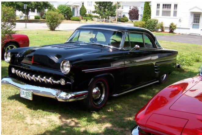
Wait a minute, that's not a Chevy!