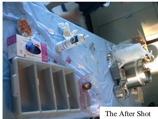
The After Shot