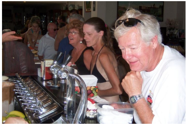
The Sundae Bar is Open