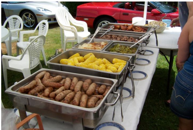
The food arrives