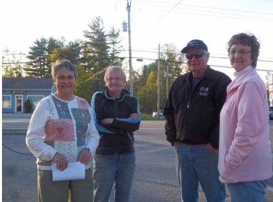
Nice & nippy out – Perfect for ice cream!