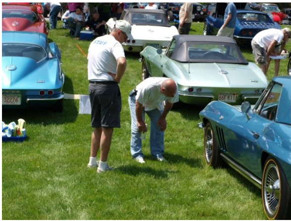
Judging – “Yup, it’s got wheels – full points!”