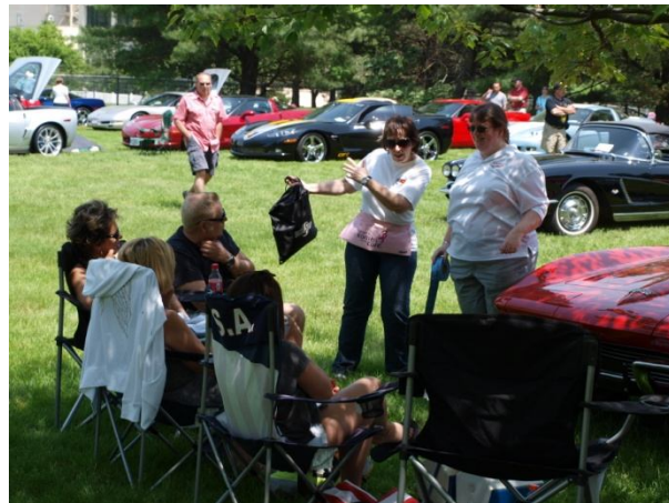
...As did our 50-50 hawkers