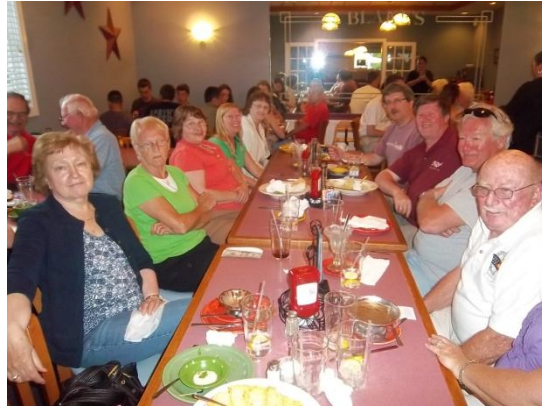
Everybody loves ice cream!