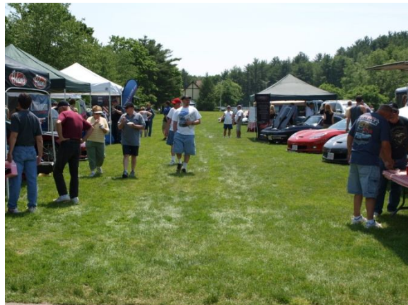
Vendor Alley had 10 vendors this year