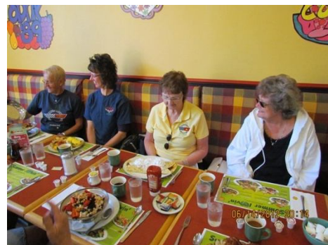
I will never get through this!

Friday morning we met and headed to Cora's for breakfast. As our hotel was downtown we walked to the restaurant. Cora's served an interesting variety of offerings where many included fruit arranged in interesting ways. Cindy ordered the chocolate crepe and when it arrived we all gasped – it was huge and she had to leave some of it behind.