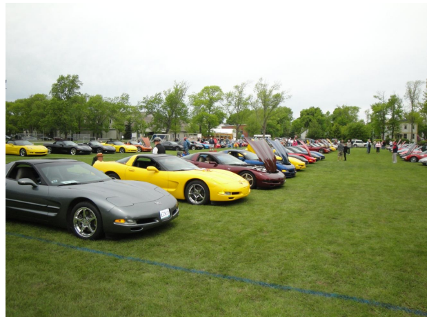
Cars on Display