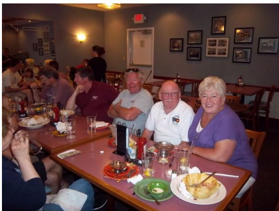
With this many people, we need our own wing!