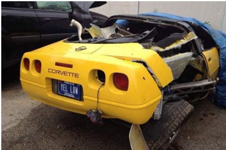
From Corvette Blogger by Mitch Talley

http://www.corvetteblogger.com/2012/05/09/accident-indiana-teen-crashes-moms-c4-corvette/