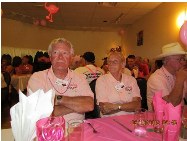
I Told You I Didn't Want to Wear Pink