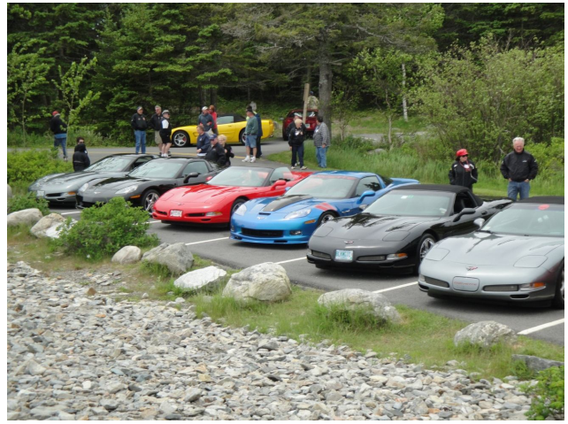
Scenic Stop on Island Cruise