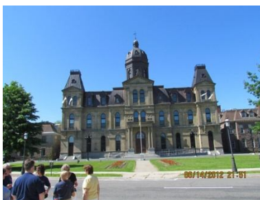
Taking in the Sites - Legislature Building

We had the day to sightsee and the afternoon found us having a late lunch at the lighthouse close to the hotel which was an ice cream stand. Ice Cream does taste good for lunch.