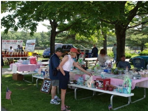
Penny & Raffle tables helped raise money