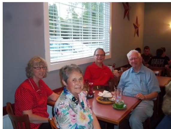
Stuck at the kids table!