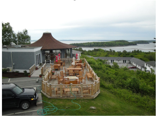
Inn's Restaurant and View