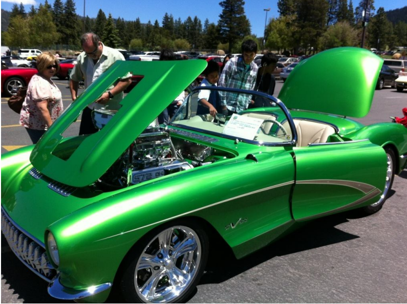
A bit of a different look for a C1

Taken at Corvettes at the Lake 2012, in Lake Tahoe