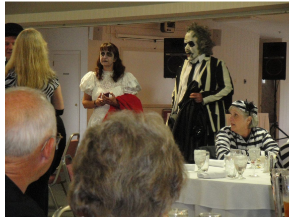
Another Idea for Black & White