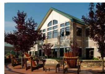
Tuesday Night - Crowne Plaza Campbell House - Lexington, KY