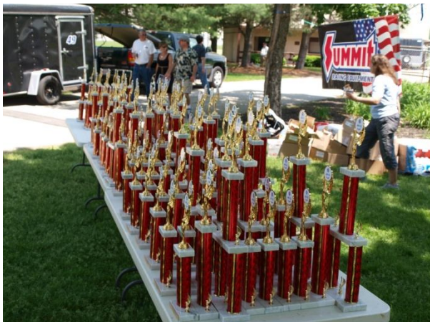
That’s a lot of trophies to be given out!