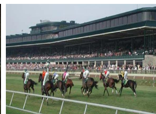
Monday Night - Stonewall I Resort - Roanoke, West Virginia