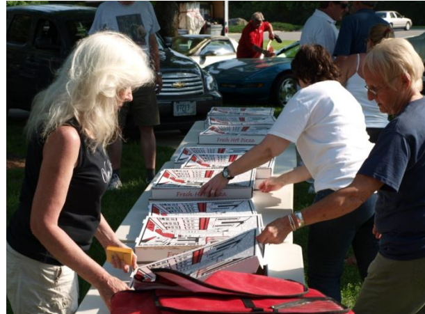
Pizza for all of our hard working members