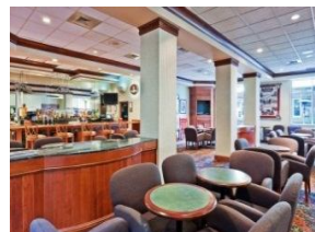
Wednesday, Thursday, Friday, Saturday - Holiday Inn University Plaza - BG, KY