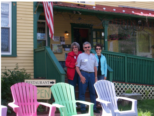
Breakfast at the Two Cats

Sunday morning we again had breakfast at the Looking Glass, packed the cars then headed out for home. A great weekend was had by all.