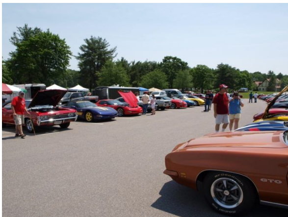
82 cars in Corral Parking – Ran out of space!