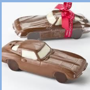
Chocolate Vette Easter Candy! (Gayle's Chocolates)