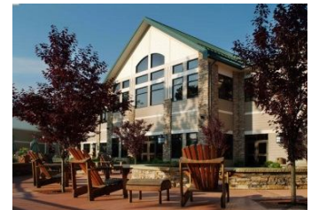
Tuesday Night - Crowne Plaza Campbell House - Lexington, KY