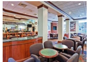
Wednesday, Thursday, Friday, Saturday - Holiday Inn University Plaza - BG, KY