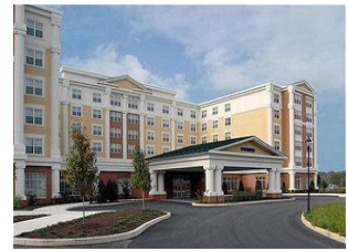
Sunday Night - Wyndham Hotel - Gettysburg, PA