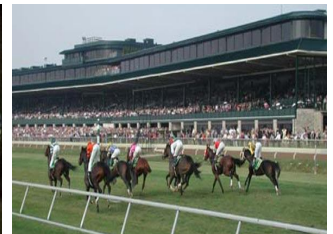
Monday Night - Stonewall I Resort - Roanoke, West Virginia