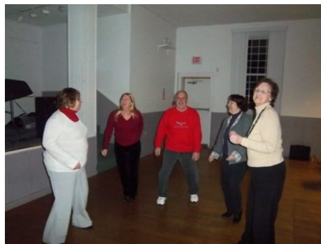
Some Get Into the Mood