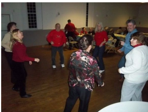
More "In the Mood" Folks