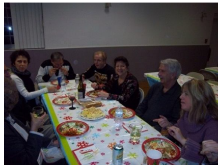
Don't Interrupt, We're Eating