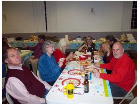
Ok, We'll Pose for You