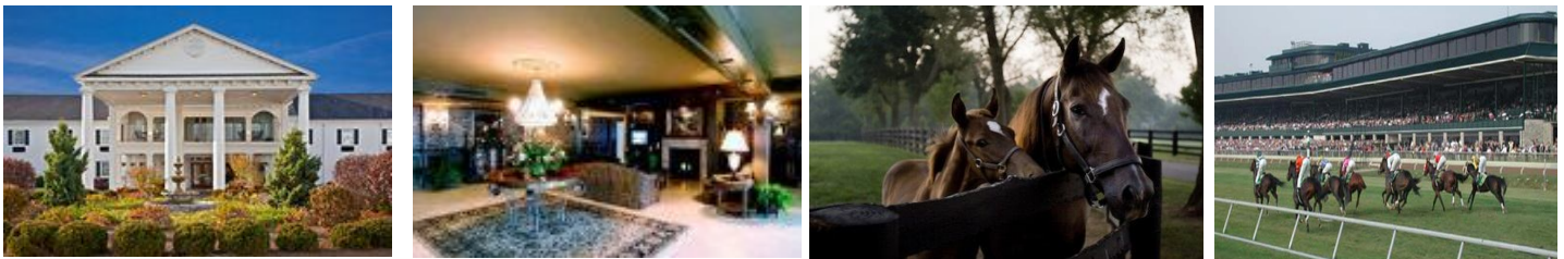
Monday Night - Stonewall I Resort - Roanoke, West Virginia