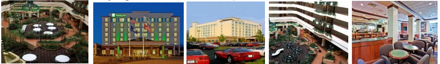
Wednesday, Thursday, Friday, Saturday - Holiday Inn University Plaza - BG, KY