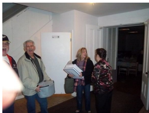
Party's Over, We're Heading Home