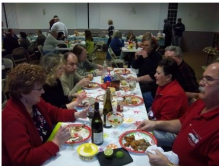
Time Out to Eat!