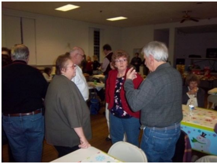
The Party is Starting