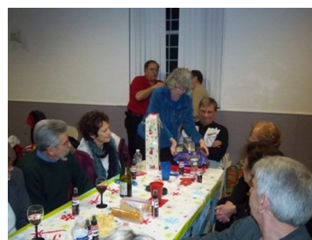
Yes, it's Better. Sorry.