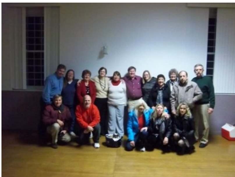
The "Clean-Up Crew"