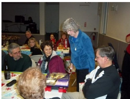
Yankee Swap – Looks Like you Have a Better Gift than I Do