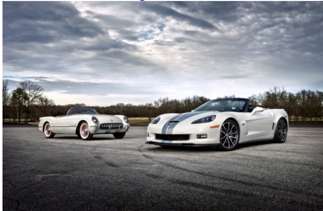
2013 60 th Anniversary 427 Convertible Collector Edition