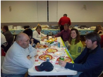
Time Out for a Picture