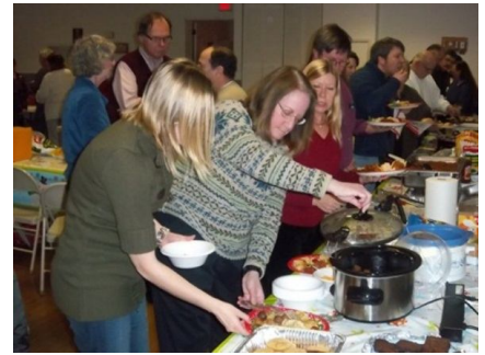
What's in this Pot?