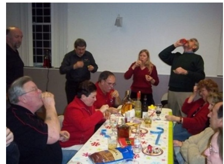
We Always Have to do Shooters!