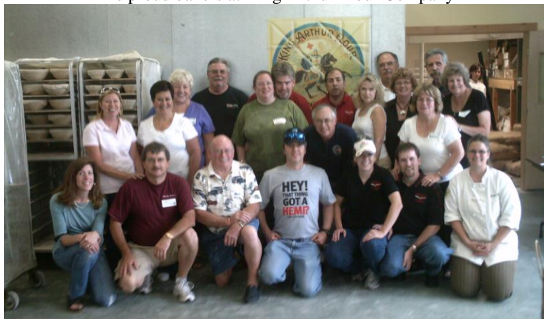
The proud bakers at King Arthur Flour Company