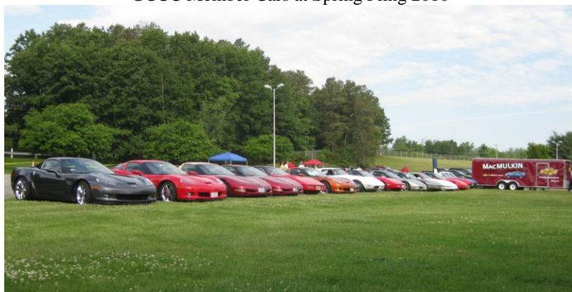
GCCC Member Cars at Spring Fling 2010