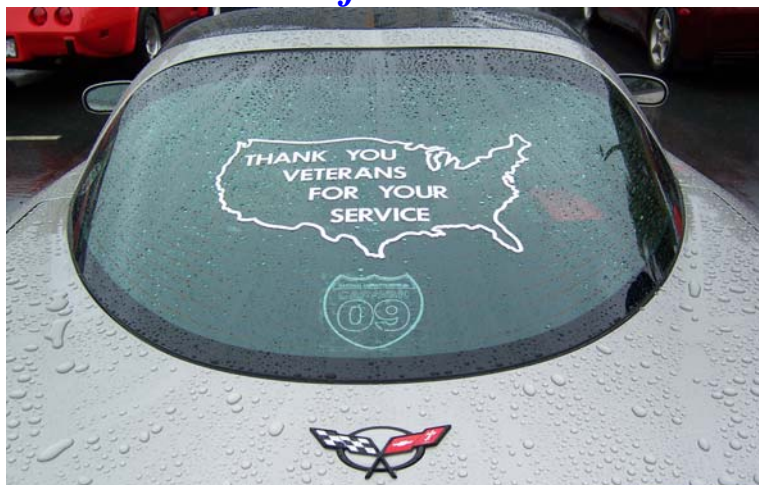
2008 Vettes to Vets – This one speaks for itself!