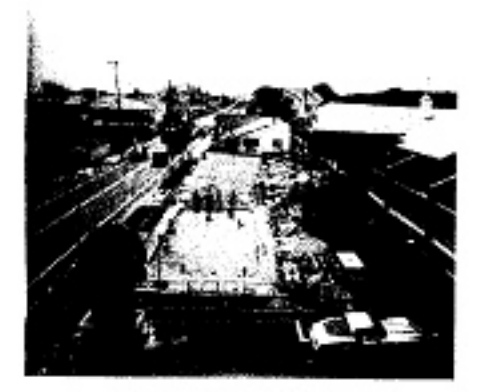
Sea Drift Motel

We have 2 beautiful motels... the Sea Drift & the Atlantis. They are located 75 yards from the beach. Rooms are immaculate and with micro's & fridge Each Motel also feature outdoor heated pools and are located only a short 10 minute walk to downtown Old Orchard Beach.