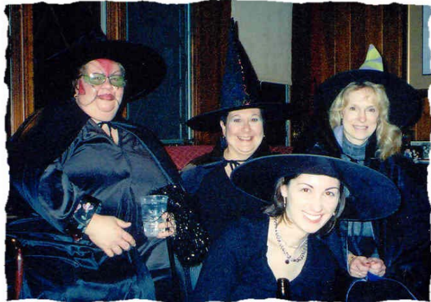
Will the real witch please stand up!