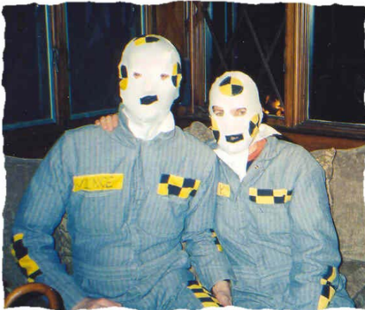
"Halloween For Dummies"