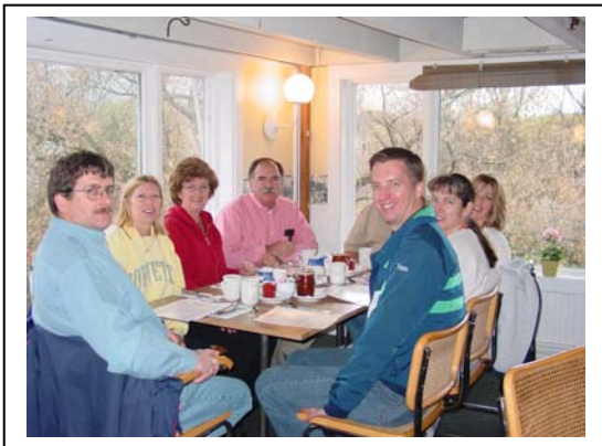
Breakfast at the Jelly Mill