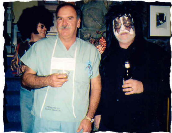
Doctor and patient relax before surgery.