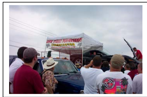
Calloway's C6 was broken-in on the Dyno Rack