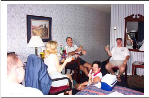
"Relaxing" after the long drive to Carlisle